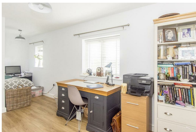
Bedroom Four 20'2" x 8'7" (6.15m x 2.62m)

A double bedroom with dual aspect windows to the front, currently being used as a work from home office.