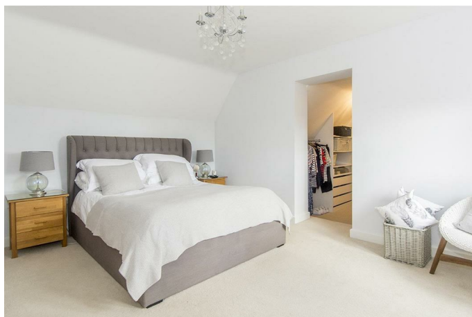
Bedroom Two & Dressing Area 14'8" x 12' (4.47m x 3.66m)

A double bedroom with a window to the rear enjoying rural views. There is a generous dressing area that could be used as an office or could be a perfect space for teenagers.( 11'5" x 7'9")