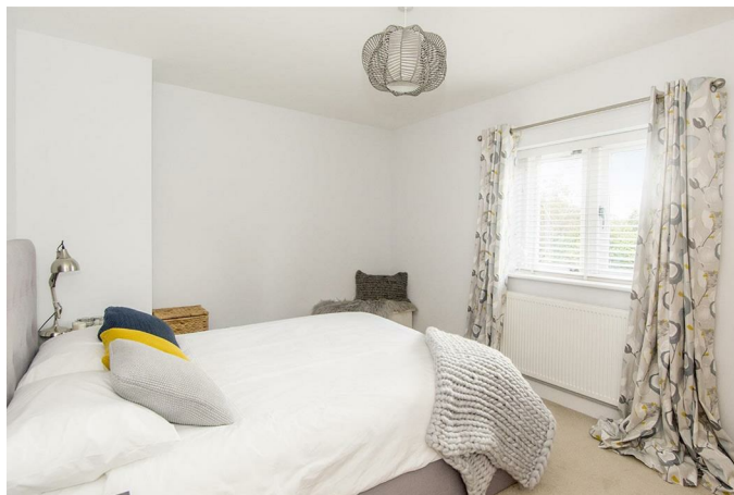
Bedroom Three 13'3" x 10'1" (4.04m x 3.07m)

A double bedroom with a window to the front aspect and built-in wardrobes.