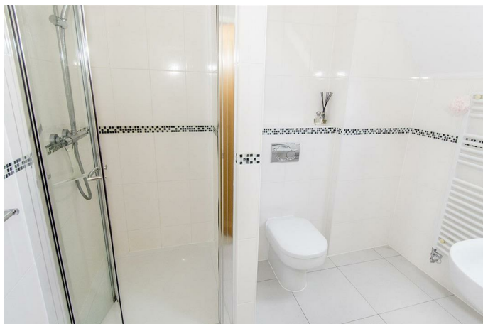
En- suite 8'5" x 5'9" (2.57m x 1.75m)

Fitted with a low flush WC, wash hand basin, shower cubicle with bi-fold doors, there is a heated towel rail & mirror, Velux window ,ceramic wall and floor tiles.