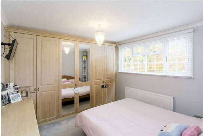
Bedroom Three 10'10 x 10'10 (3.30m x 3.30m)

A double bedroom with a window to the front aspect with built in wardrobes and dressing table with drawers.