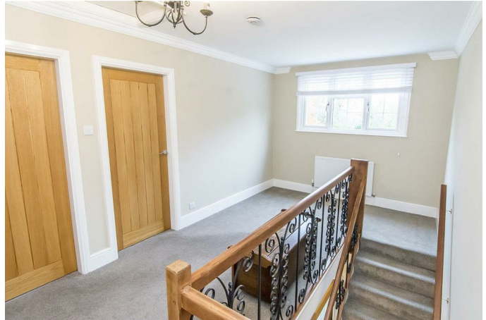
Landing 16' x 9'5" (4.88m x 2.87m )

This spacious light and airy landing has a window to the front aspect and a loft hatch gives access to the boarded loft space which has power and light.