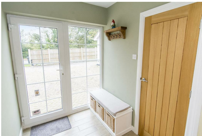
Porch 5'10" x 6'9" (1.78m x 2.06m)

You enter into this spacious porch where you will find ceramic floor tiles and ample room for your outdoor coats and boots. A set of oak double doors open into the hallway.