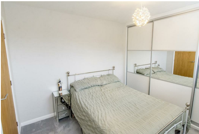
Bedroom Four 9'7 x 9'6 (2.92m x 2.90m)

A double bedroom with built in mirror fronted wardrobes and a window to the rear aspect.