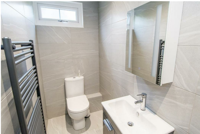
En-Suite 11'9" x 3'7" (3.58m x 1.09m)