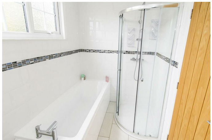
Bathroom Photo Two

Fitted with a low level WC, hand wash basin set onto a vanity unit, bath, separate shower enclosure ,ceramic wall & floor tiles , heated towel rail and an opaque window to the rear aspect.