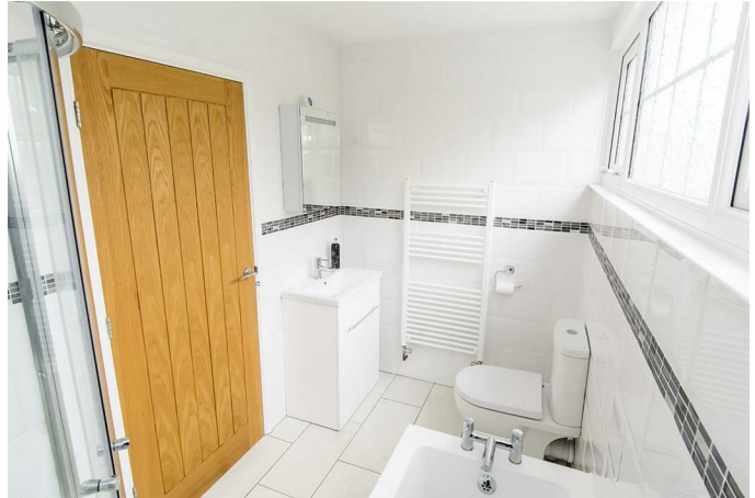
Bathroom 9'7 x 9'6 (2.92m x 2.90m)

Fitted with a low level WC, hand wash basin set onto a vanity unit, bath, separate shower enclosure ,ceramic wall & floor tiles , heated towel rail and an opaque window to the rear aspect.