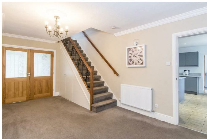
Reception Hall 19'9" x 9'3" (6.02m x 2.82m)

The impressive hallway has a staircase with bespoke storage space rising to the first floor accommodation.