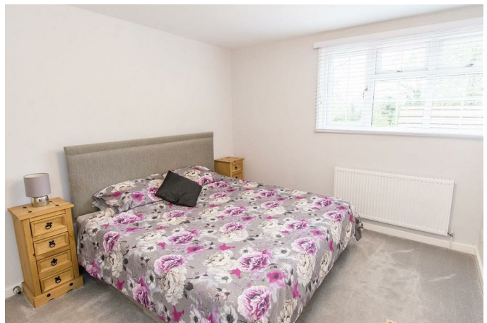
Bedroom One 11'10 x 10'6 (3.61m x 3.20m)

A double bedroom with a window to the front aspect. A door opens into the En-suite.