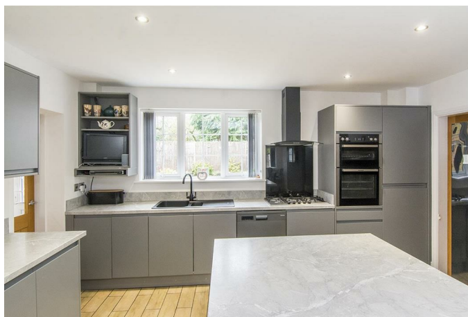
Living Kitchen 26'1 x 14'3 (7.95m x 4.34m)

Fitted with a wide range of modern grey cabinets with complimenting surfaces. Composite bowl and half sink unit with mixer taps. Eye-level double oven, five burner gas hob with extractor canopy over. There is space for a dishwasher and fridge freezer. The central island provides ample breakfast bar seating and additional storage cabinets. Dual aspect windows allow lots of natural light in.