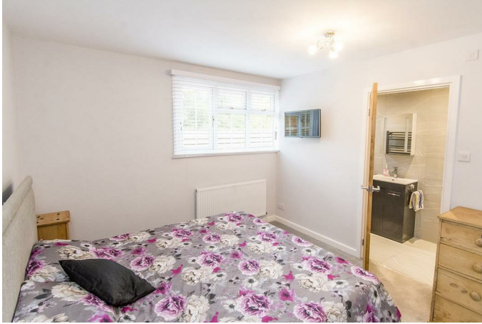
Bedroom One Photo Two