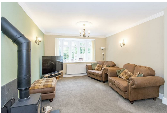
Open Plan Lounge and Dining Room 26'1 x 12'4 (7.95m x 3.76m)

The lovely bay fronted lounge has a wood burning stove providing warmth in the winter months. Opening through to the spacious dining room with a window that overlooks the garden, the perfect space to entertain friends and family.