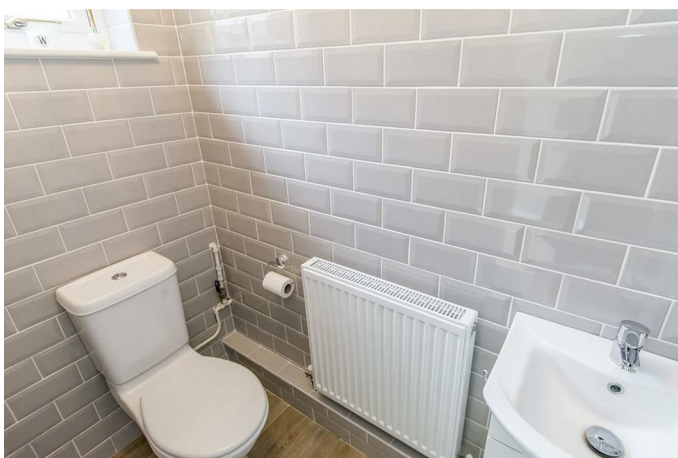
Cloakroom 5'10" x 2'11" (1.78m x 0.89m)

Fitted with a low level WC, hand wash basin set onto a vanity unit, radiator, ceramic wall & floor tiles and an opaque window to the front aspect.