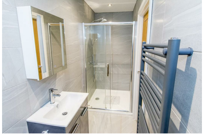
En-suite Photo Two