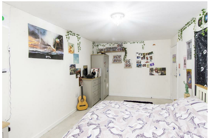
Bedroom Photo Two