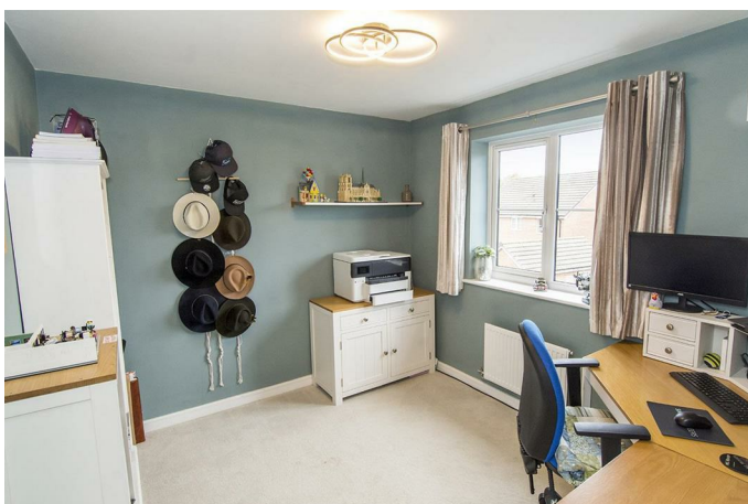
Bedroom Four 10'0 x 8'11 (3.05m x 2.72m)

A double bedroom with a window overlooking the garden which is currently being used as a work from home office.