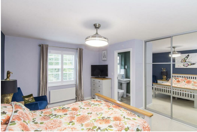
Master Bedroom Photo Two