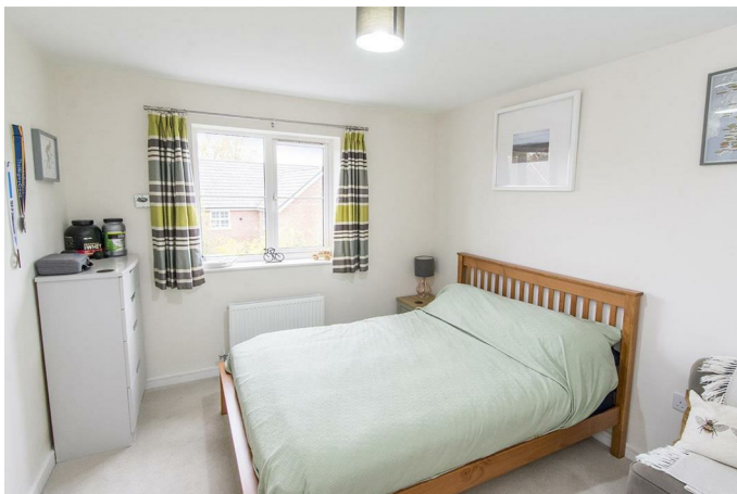
Bedroom Three 12'7 x 9'11 (3.84m x 3.02m)

A double bedroom with a window overlooking the garden.