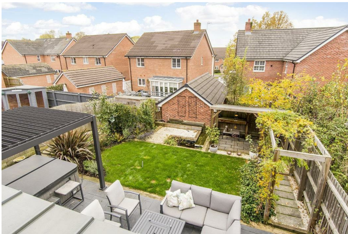
Garden Photo Three