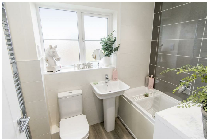
Bathroom 5'5" x 7'3" (1.65m x 2.21m)

Fitted with a low level WC, pedestal wash hand basin, bath with shower and side screen. Chrome heated towel rail. Ceramic wall tiles, luxury vinyl flooring and an opaque window to the rear aspect.