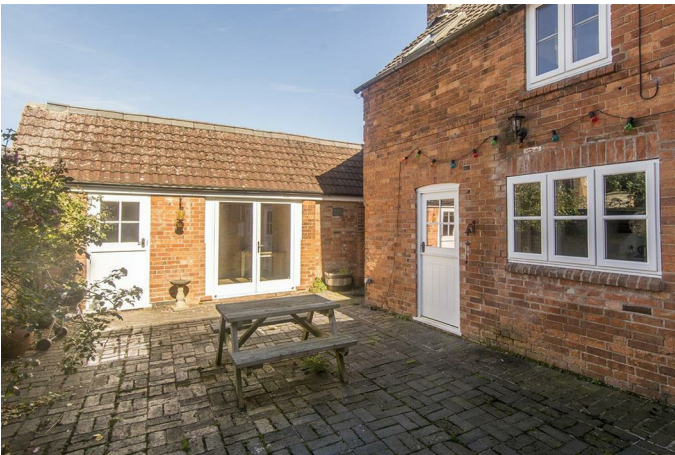
Annexe & Courtyard