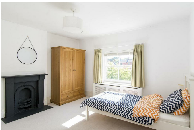
Bedroom Two 13'2" x 12'4" (4.01m x 3.76m)

A double bedroom with a sash window to the front aspect. Cast iron fireplace. Radiator set into a bespoke decorative cabinet. Two storage cupboards.