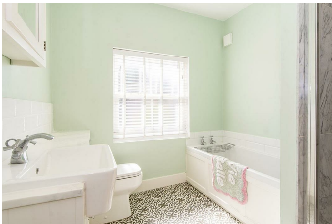
Bathroom 8' x 7'8" (2.44m x 2.34m)

Fitted with a back to wall WC. Hand wash basin set onto a bespoke vanity unit. Bath and separate shower enclosure with bi-folding doors. Chrome heated towel rail. Ceramic wall and floor tiles. Opaque window to the front aspect.