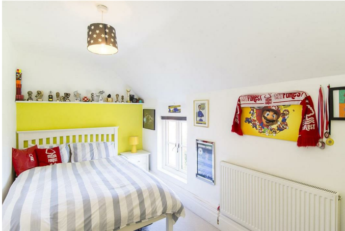
Bedroom Four 13' 10" x 6'10" (3.96m 3.05m x 2.08m)

A double bedroom with a window overlooking the garden. Radiator.