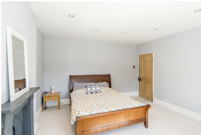
Bedroom One 15'7" x 13'1" (4.75m x 3.99m)

A double bedroom with a sash window to the front aspect. Cast iron fireplace. Radiator set into a bespoke decorative cabinet.