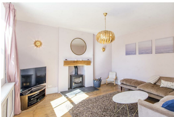
Sitting Room 15'2" x 13' (4.62m x 3.96m)

Sash window to the front aspect. Fireplace with slate hearth and oak beam mantle housing a wood burning stove. Oak flooring. Radiator set into a decorative cabinet.