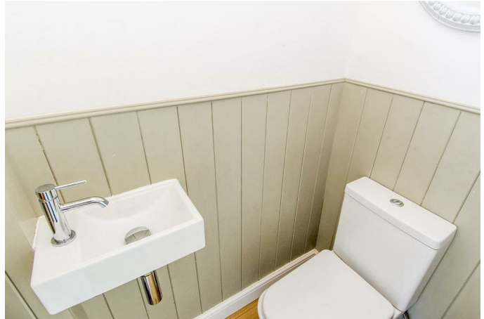
Cloakroom 4'5" x 14'11" (1.35m x 4.55m )

Fitted with a low level WC and hand wash basin. Oak flooring and an extractor fan.