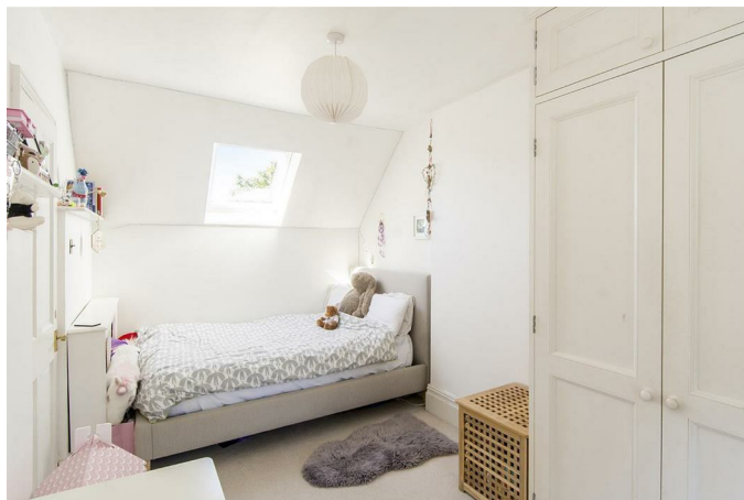
Bedroom Three 15'3" x 8'2" (4.65m x 2.49m)

A double bedroom with a window overlooking the garden and a Velux roof window. Radiator set into a bespoke decorative cabinet.