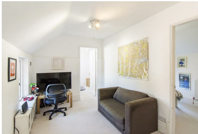
Snug 13'9" x 8' (4.19m x 2.44m)

Situated between bedrooms three and four with a window to the side aspect ,tv point and radiator.