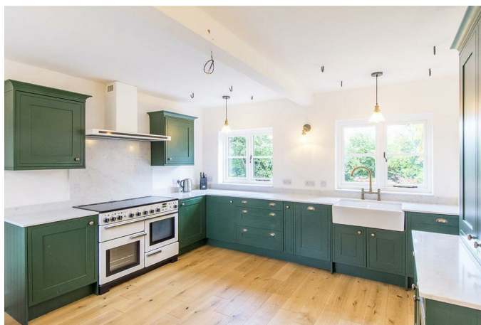
Breakfast Kitchen 15'1" x 13'7" (4.60m x 4.14m)

Fitted with a wide range of modern painted cabinets with quartz surfaces. Belfast double sink with mixer taps. Rangemaster oven with extractor canopy. Complimenting dresser unit. Integral dishwasher and recycling bin system. Oak flooring. Dual aspect windows. Door opens into the utility.