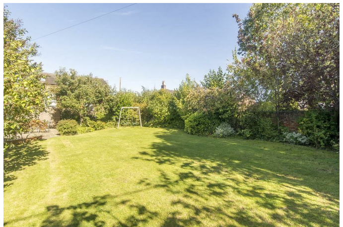
Garden Picture Two

The walled garden is mainly laid to lawn with well stocked shrub borders and mature trees. There is an extensive paved patio seating area which is the ideal spot to enjoy al fresco dining in the summer months. There is also a courtyard garden which has a set of double timber gates and is perfect for having a Barbeque.