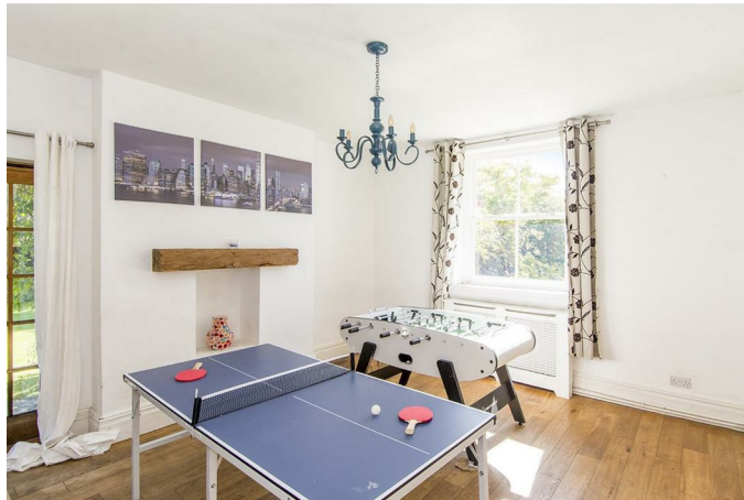
Dining Room 15'1" x 13'1" (4.60m x 3.99m)

Sash window to the front aspect and a set of French doors open into the garden. Feature fireplace with oak beam mantle. Oak flooring. Two radiators set into a decorative cabinets. This room is currently being used as a games room.