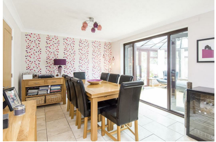
Dining Room 12'6" x 10'3" (3.81m x 3.12m)

Open plan to the breakfast kitchen this spacious dining room is the perfect space to entertain friends and family. A set of French doors open into the conservatory.