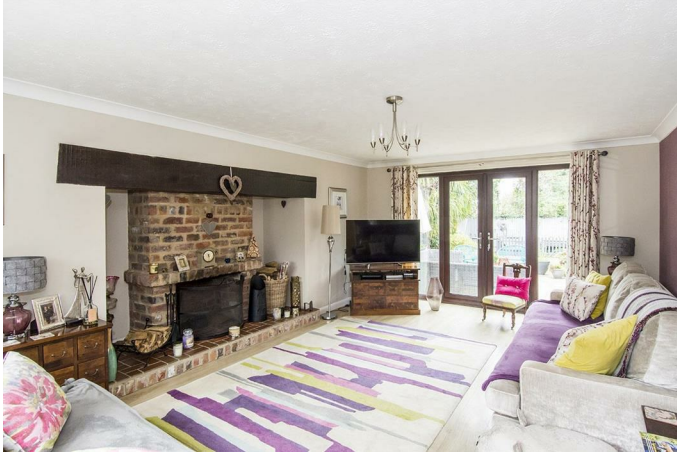
Lounge 19'3" x 12'9" (5.87m x 3.89m)

This lovely lounge has a fabulous brick inglenook fireplace housing an open fire. Luxury vinyl flooring. A window to the front aspect and a set of French doors open into the garden.