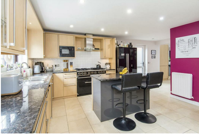
Breakfast Kitchen ( 2)