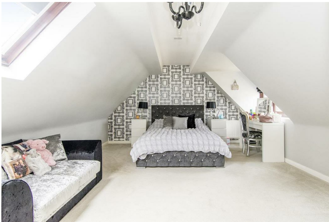
Bedroom Two 17;8" x 13'10" (5.18m;2.44m x 4.22m)

A double bedroom with a Velux roof window to the rear aspect and a window to the front aspect allowing lots of natural light in. A door opens into a sizable dressing room.