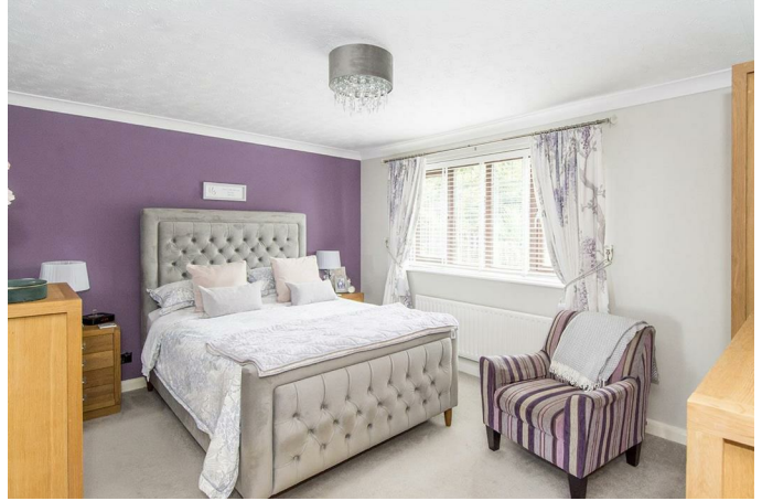
Bedroom One 14'8" x 11'5" (4.47m x 3.48m)

A double bedroom with a window overlooking the garden.