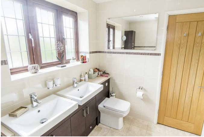
En-suite 8'3" x 6'10" (2.51m x 2.08m)

Fitted with a back to wall WC, dual wash hand basins set onto a set bespoke vanity cupboards, corner shower cubicle, chrome heated towel rail, Luxury vinyl flooring, ceramic wall tiles and an opaque window to the front aspect.