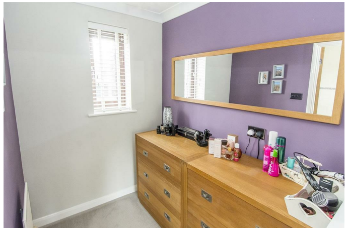
Dressing Area 7'1" x 5'2" (2.16m x 1.57m)

The perfect space has a window to the front aspect and a door opens into the en-suite.