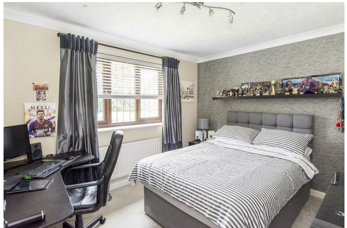
Bedroom Three 11' x 10'7" (3.35m x 3.23m)

A double bedroom with a window overlooking the garden.