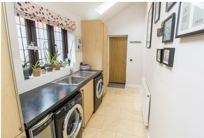
Utility 15' x 5'7" (4.57m x 1.70m)

There is space for a washing machine ,tumble dryer and wine cooling fridge. Travertine flooring. There is a window to the side aspect and a personal door that gives access to the double garage.