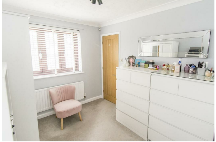
Dressing Room 10'9" x 8'3" (3.28m x 2.51m)

This flexible room gives access to bedroom two and has a window to the front aspect.