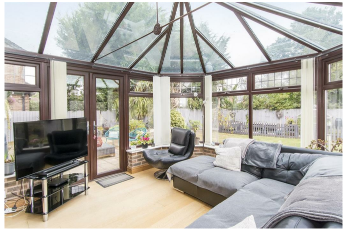
Conservatory 12'2" x 8'10" (3.71m x 2.69m )

This spacious conservatory has a glass roof, solid oak underfloor heating, blinds to the windows and a set of French doors open into the garden.