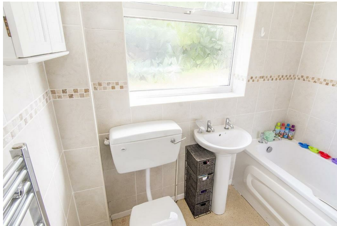
Bathroom 7' x 5' (2.13m x 1.52m)

Fitted with a low level WC, pedestal wash hand basin, bath with an electric shower over, chrome heated towel rail , ceramic wall and floor tiles. Opaque window to the rear aspect.