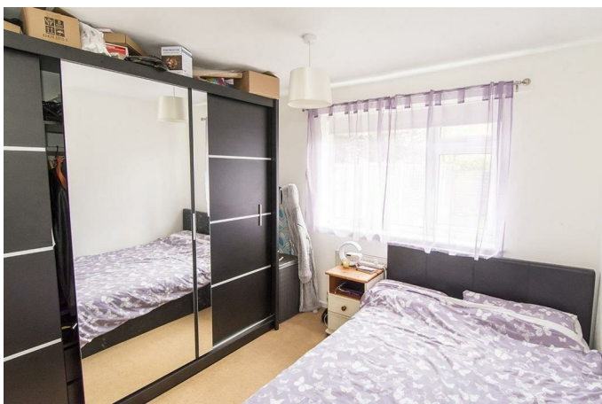
Bedroom Two 10' 9' (3.05m 2.74m)

A double bedroom with a window to the rear aspect and a radiator.