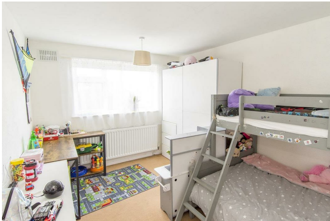
Bedroom One 13' x 9' (3.96m x 2.74m )

A double bedroom with a window to the front aspect and a radiator.