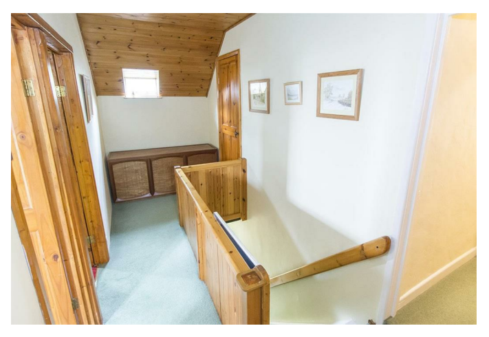
Timber balustrade. Fitted linen cupboard. Radiator. Doors to rooms.