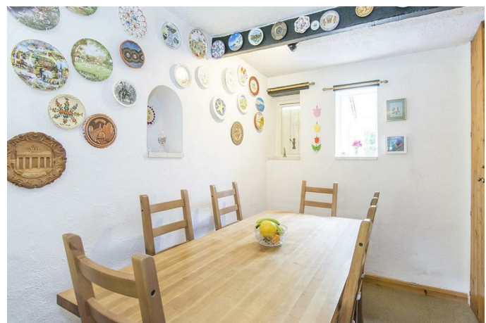
Lean-To 10'10" x 6'0" (3.30m x 1.83m)