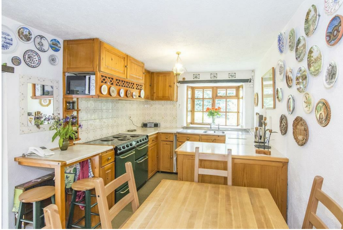
Kitchen/Breakfast Room 16'2" x 8'7" (4.93m x 2.62m)

Range of pine facing fitted base and wall units. Fitted electric range style cooker. Roll edge work surfaces. Stainless steel sink and double drainer. Multi paned window to the front elevation and two windows to the rear. Telephone point. Walk in larder cupboard. Telephone point.