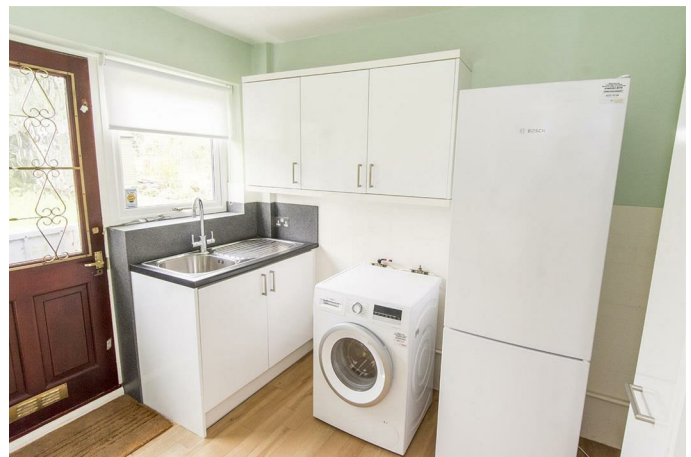
Utility Room 9'11 x 6'10 (3.02m x 2.08m)

Fitted with wall units, stainless steel sink unit with mixer taps, space for a washing machine & tumble dryer, wall mounted Worcester Bosch gas central heating boiler, wood effect laminate flooring, window to the rear aspect and a back door gives access to the outside.