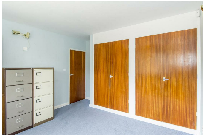
Bedroom Two Photo Two

A double bedroom with a window to the front aspect, built-in wardrobes and a radiator.