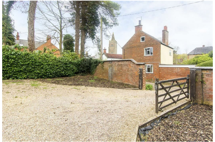
Outside & Parking

The frontage is walled and has a timber five bar gate that opens into the gravel drive which provides ample off road parking. There is a further paved area to the side that leads to the garage and gated access to the garden.