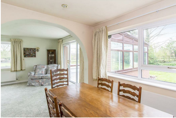
Dining Room 9'11 x 9'00 (3.02m x 2.74m)

The dining room has a window overlooking the garden and a radiator.