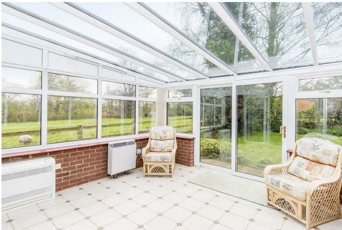
Conservatory 12'04 x 13'00 (3.76m x 3.96m)

With wonderful views over the garden this lovely conservatory has a glass roof, electric wall heater, air conditioning unit, ceramic floor tiles and a set sliding patio doors open into the garden.