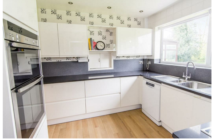
Kitchen 9'10 x 9'10 (3.00m x 3.00m)

With a window overlooking the garden the kitchen is fitted with a range of modern gloss cabinets with granite surfaces, Neff built-in double oven, electric ceramic hob with extractor, stainless steel bowl and half sink unit with mixer taps, wood effect laminate flooring and space for a dishwasher.