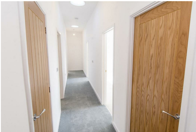
Bedroom Hallway 12'8" x 6' max (3.86m x 1.83m max )

The hallway leading to the bedrooms and bathrooms has been fully carpeted with solid oak communicating doors and roof light tunnels to allow lots of natural light in.