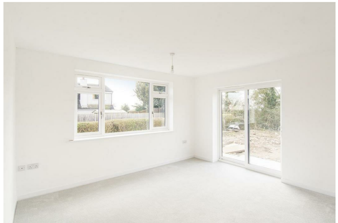
Lounge 16'9" x 13'2" (5.11m x 4.01m)

This lovely sunny lounge has a window to the side aspect and a set of sliding patio doors opening onto the garden.