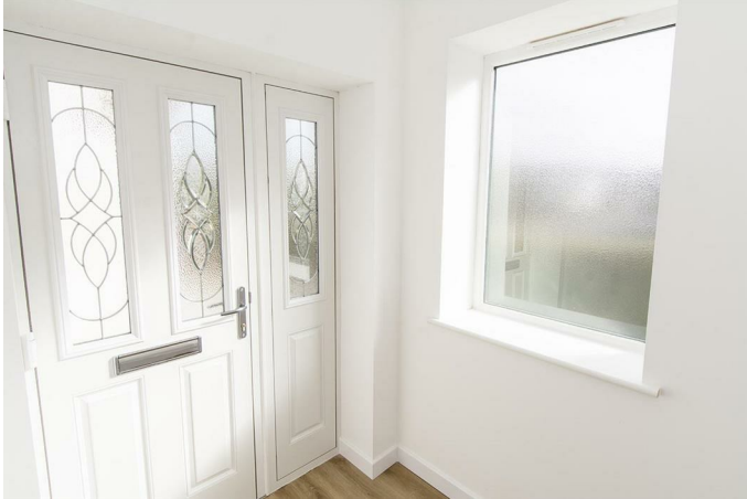
Entrance Porch 5'10" x 6'4" (1.78m x 1.93m)

Enter via a composite door with a large side window and Luxury vinyl flooring.