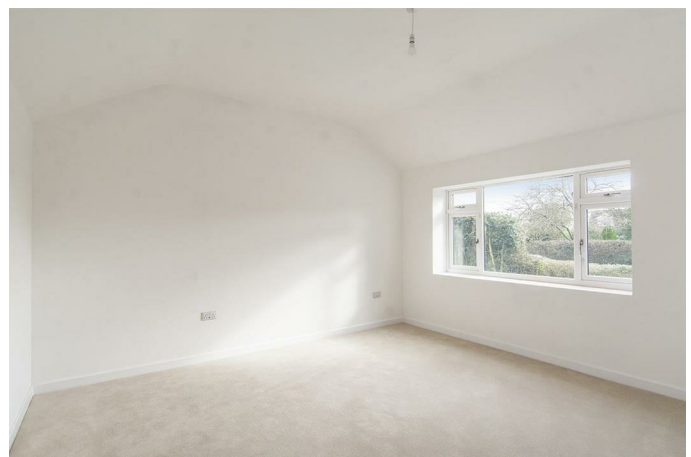
Principal Bedroom 14' x 16'10" (max )12'11" ( min) (4.27m x 5.13m (max )3.94m ( min))

A double bedroom with a window to the side aspect and a door opening to the En-suite.