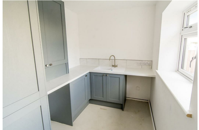
Utility 10'6" x 6'10" (3.20m x 2.08m)

Fitted with a range of modern painted cabinets with complimenting surfaces. Composite sink unit with mixer taps over. Space and plumbing for a washing machine and tumble dryer. The large cupboard houses the hot water cylinder and central heating system. The inverter and battery for the solar panels. The glazed back door opens into the rear courtyard which is paved and is ideal spot to set up a washing line.