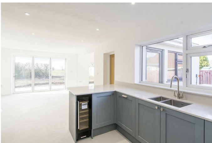
Day Room 24'11" x 9'8" (7.59m x 2.95m)

This spacious area is open-plan to the kitchen and dining room and has a set of sliding patio doors and also a set of bi-folds opening onto the patio.