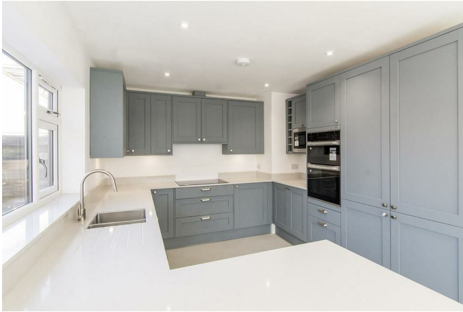
Kitchen/ Dining Area/Day Room 19'5" x 10'3" (5.92m x 3.12m)

Fitted with modern painted kitchen cabinets and quartz work surfaces. Double built-in oven and microwave. Induction hob with extractor canopy over. Full height integral fridge & freezer and dishwasher. Wine cooler fridge and red wine rack. Stainless steel bowl and half undermounted sink unit with mixer taps. Integrated recycling bin storage cupboard complete with a bin liner drawer. A door opens into the utility .