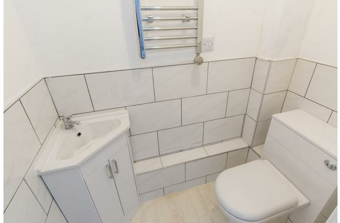
Cloakroom 5'6" x 3'3" (1.68m x 0.99m)

Fitted with a low level WC and wash hand basin. Chrome heated towel rail. Half height ceramic tiled walls and cushioned flooring.