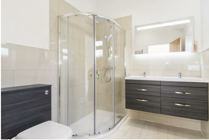
Principal En-suite 7'5" x 6'10" (2.26m x 2.08m)

Fitted with a back to wall WC. Dual wash hand basins set onto a bespoke drawer unit with an illuminated mirror over that has Bluetooth. Corner shower enclosure with dual shower heads and ceramic wall tiles. Toothbrush charger and shaver socket. Chrome heated towel rail. Half height ceramic wall tiles, cushioned flooring and a obscure glazed window .