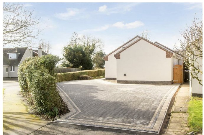
Outside & Parking

The extensive block paved drive provides ample off road parking and there is adequate room to build a garage if