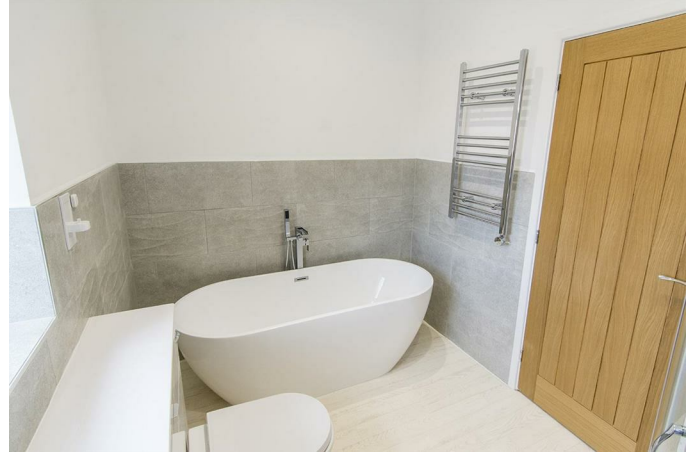
Bathroom 9'5" x 6'10" (2.87m x 2.08m)

Fitted with a back to wall WC. Wash hand basin set onto a bespoke drawer unit. Standalone bath with mixer taps and a hand held shower head. Corner shower enclosure with dual shower heads and ceramic wall tiles. Toothbrush charger and shaver socket. Chrome heated towel rail. Half height ceramic wall tiles, cushioned flooring and a obscure glazed window .