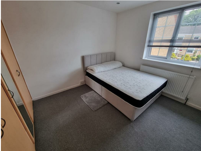
Bedroom One 12'10" max x 9'6" (3.91m max x 2.90m)

Double glazed window to the rear aspect. Fitted wardrobes and airing cupboard housing lagged hot water tank. Television point. Radiator.