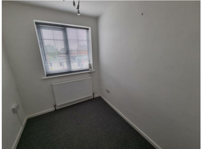
Bedroom Three 8'0" x 6'4" (2.44m x 1.93m)

Double glazed window to the front elevation. Radiator.