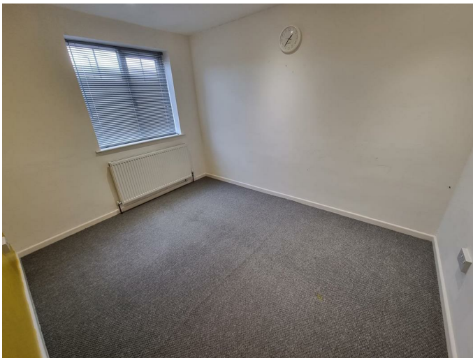
Bedroom Two 11'0" x 8'9" (3.35m x 2.67m)

Double glazed window to the front elevation. Access to loft space with retractable loft ladder. Radiator.