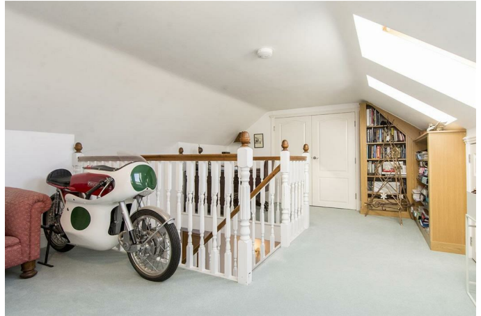
Second Floor Landing 13' x 18'11" (3.96m x 5.77m)

This spacious landing has three Velux windows & under eaves storage space. There is ample room to have a study area. Doors lead to the shower room, dressing room and a set of double doors into bedroom six.