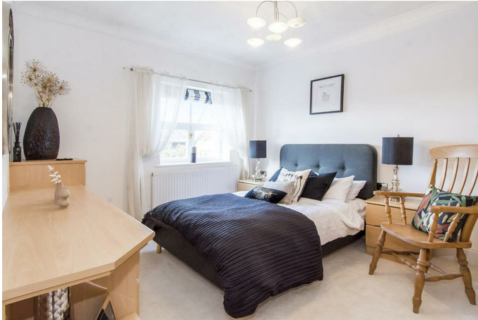
Bedroom Five 9'5" x 8'10" (2.87m x 2.69m)

A double bedroom with a window overlooking the garden and built-in wardrobes and a dressing table.