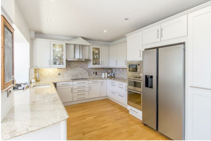
Kitchen 15'8" x 22'7" (4.78m x 6.88m)

This fabulous dining kitchen is the heart of the home and is fitted with a wide range of bespoke cabinets with granite surfaces. The appliances include a built-in double oven & microwave. Aga. Rangemaster induction hob & extractor canopy over. Porcelain bowl and half sink unit with mixer taps. American fridge-freezer. Breakfast bar seating area.