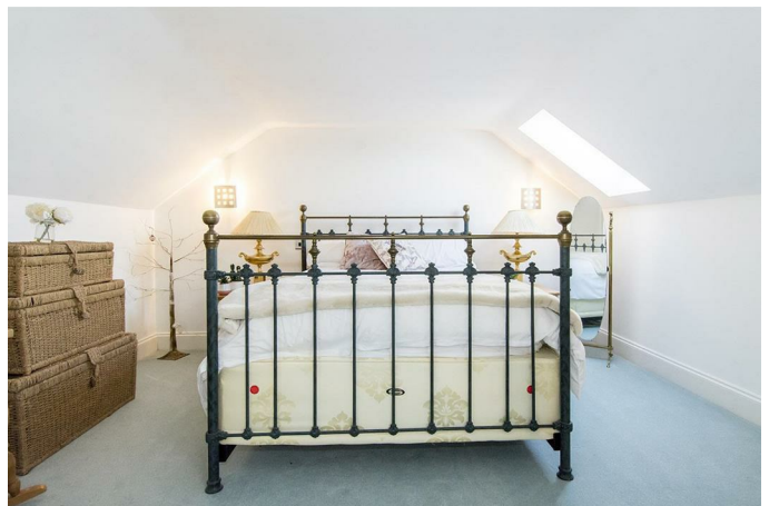
Bedroom Six 13'3" x 9'9" (4.04m x 2.97m)

A double bedroom with a Velux window. Having its own separate dressing room and shower room on the second floor.