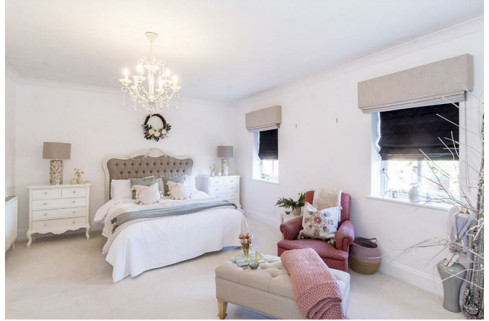
Principal Bedroom 12'8" x 17'3" (3.86m x 5.26m)

A king-sized bedroom has dual windows to the front aspect and doors opening into the dressing room and the En-suite.