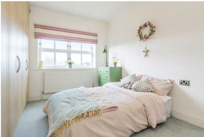
Bedroom Two 10'6" x 10'6" (3.20m x 3.20m)

A double bedroom with a window to the front aspect and a built-in wardrobes.