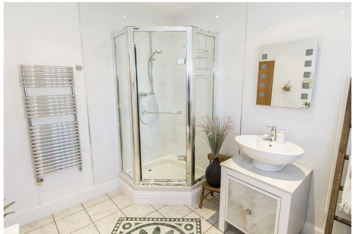
En- Suite 7' x 9' (2.13m x 2.74m)

Fitted with high quality 'Vernon Tutbury' sanitary ware to include: Low level WC, oval wash hand basin set onto a bespoke cabinet, corner shower enclosure, chrome heated towel rail, ceramic wall and floor tiles. Obscure glazed window to the side aspect.