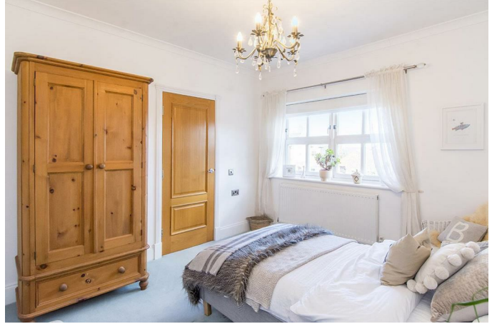
Bedroom Three 13'11" x 10'11" (4.24m x 3.33m)

A double bedroom with a window overlooking the garden and a built-in wardrobe.