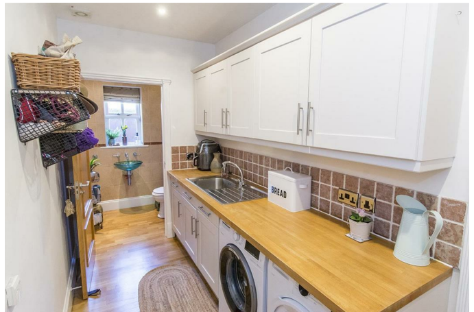
Utility 5'5" x 12'1" (1.65m x 3.68m)

Fitted with a range of cabinets with oak block surfaces. Franke stainless steel sink unit. Space and plumbing for a washing machine & tumble dryer. A personal door gives access to the garage.