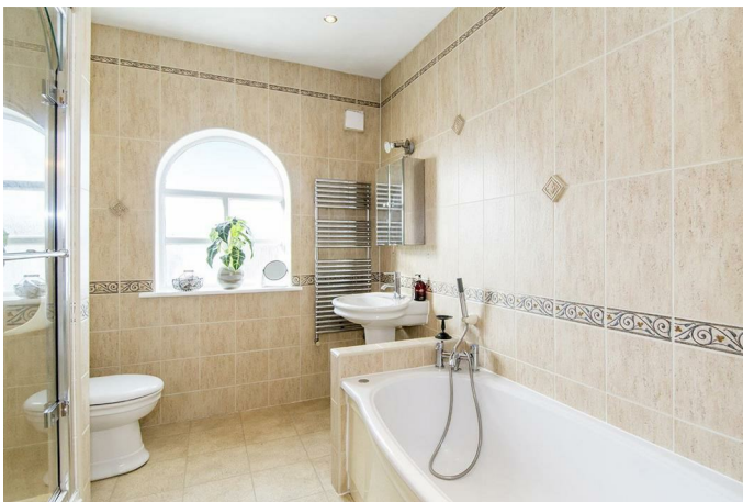
Family Bathroom 9' x 7' (2.74m x 2.13m)

Fitted with high quality 'Vernon Tutbury' sanitary ware to include: Low level WC, pedestal hand basin, bath with mixer taps, separate corner shower enclosure, chrome heated towel rail, ceramic wall and floor tiles. Obscure glazed window to the rear aspect.