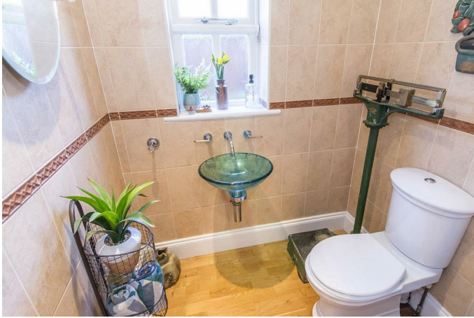
Cloakroom 5' x 4' (1.52m x 1.22m)

Fitted with a low level WC & a circular hand wash basin. Ceramic wall tiles and wooden flooring. Obscure glazed window to the side aspect.