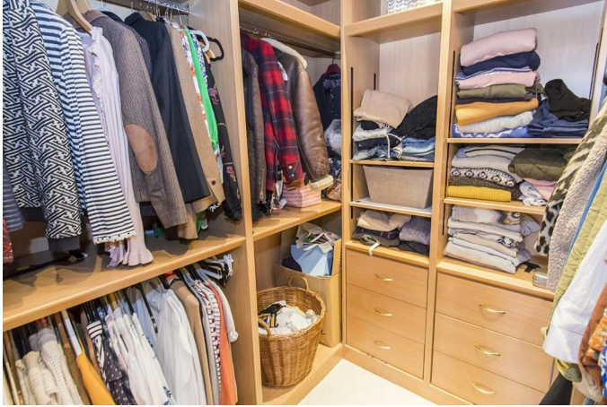
Dressing Room 7'x 7' (2.13m x 2.13m)

Fitted with a range of bespoke clothes hanging space to include drawers and inset pelmet lighting.