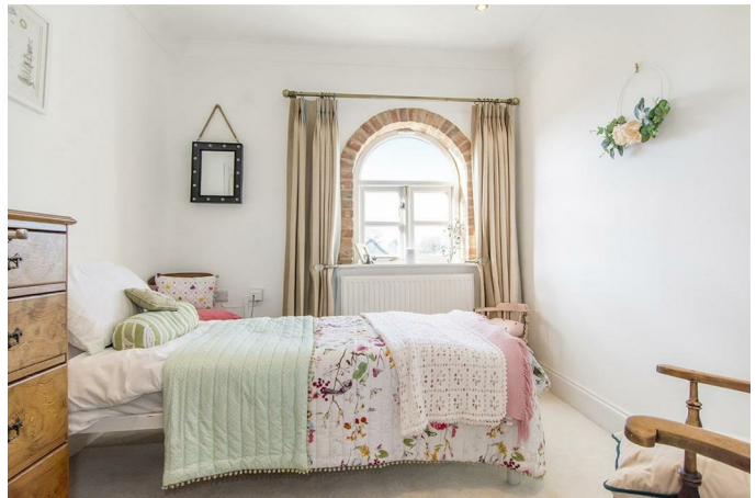
Bedroom Four 16'6" x 14' (5.03m x 4.27m)

A double bedroom with an a feature arched window overlooking the garden.