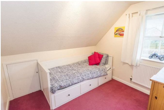
Bedroom Three 11'4 x 9'4 (3.45m x 2.84m )

A double bedroom with under eaves storage, radiator and a window overlooking the garden.