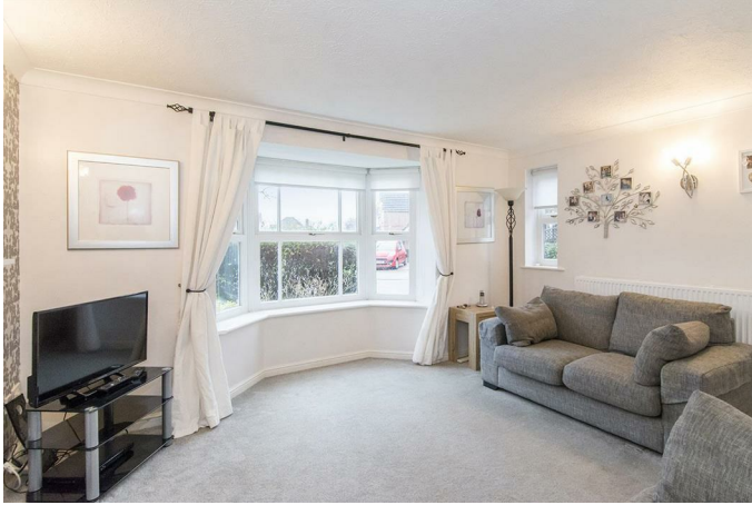
Lounge 13'8 x 11'6 (4.17m x 3.51m )

This light and airy lounge has an attractive bay window to the front aspect, dual aspect windows to the side and a feature fire place housing a coal effect gas fire.