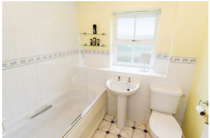
Bathroom 6'8 x 6'1 (2.03m x 1.85m )

Fitted with a white suite comprising of, low flush WC, hand wash basin and a paneled bath with shower and screen. There is an obscure glazed window to the rear aspect