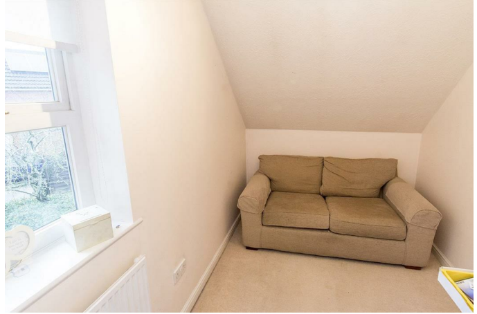
Bedroom Four 11'5 x 6'10 (3.48m x 2.08m )

This bedroom has a window to the front aspect and a radiator. Could be used as a work from home office.