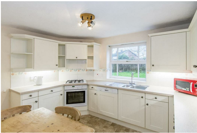
Breakfast Kitchen 11'10" x 9'05" (3.61m x 2.87m)

Fitted with a wide range of cream cabinets with complimenting work surfaces. Neff built under single oven with gas hob and extractor hood. Integral fridge and space for a dishwasher.