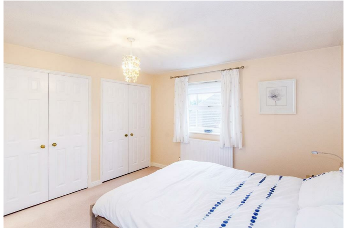
Master Bedroom 11'10 x 11'9 (3.61m x 3.58m)

A double bedroom with a range of built in wardrobes, a window to the front aspect and a radiator. Door opens into the En-suite.