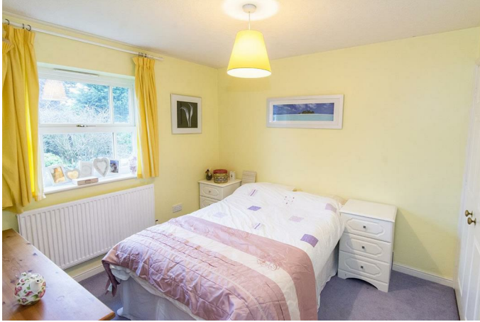
Bedroom Two 9'8 x 9'7 (2.95m x 2.92m )

A double bedroom with built in wardrobes. Window to the rear aspect. Radiator.