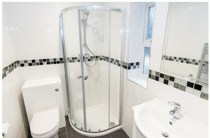
En-Suite 6'7 x 4'8 (2.01m x 1.42m)

Obscure glazed window to the side aspect, chrome heated towel rail, suite comprising of a wash hand basin, low flush WC, enclosed shower cubicle with thermostatically controlled shower, full height ceramic wall and floor tiling.