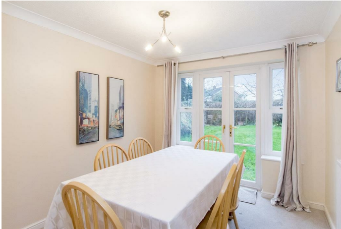
Dining Room 9' x 9' (2.74m x 2.74m)

The dining room is the perfect space to entertain and has a set of French doors that open into the garden.