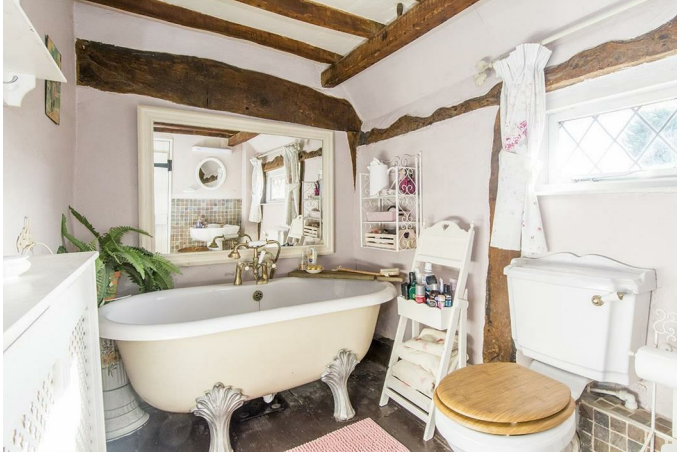
Bathroom 9'3" x 5'11" (2.82m x 1.80m)

Fitted with a standalone roll top bath with shower attachment mixer taps, pedestal hand wash basin, low flush WC, exposed timber beams and stripped floorboards.