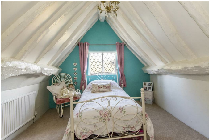
Bedroom Three 12'1" x 10'2" (3.68m x 3.10m)

This pretty single bedroom has a window to the front aspect and exposed timber ceiling beams.