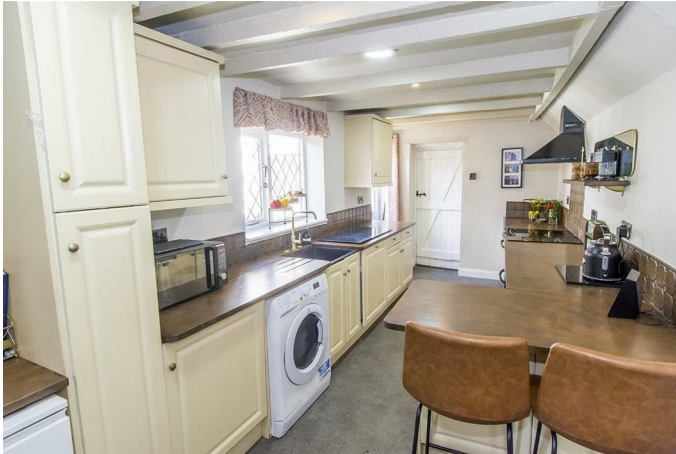
Breakfast kitchen Photo Two