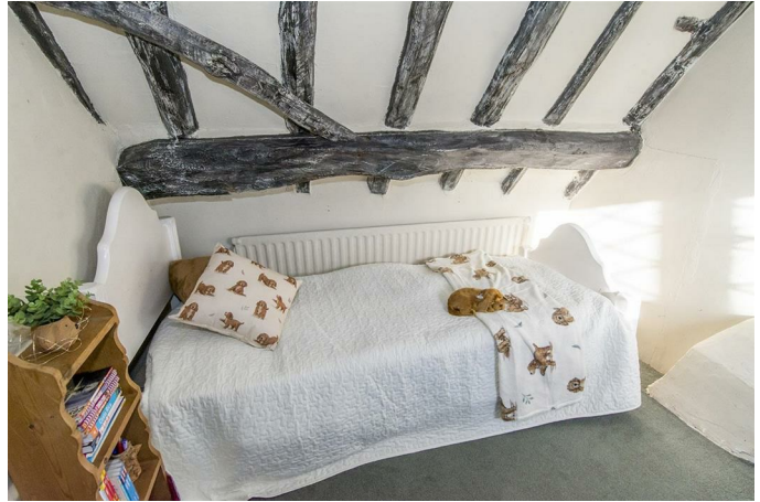
Bedroom Four 10'5" x 8'5" with sloping ceiling (3.18m x 2.57m with sloping ceiling)

This lovely single bedroom has a window overlooking the garden and has exposed timber ceiling beams.