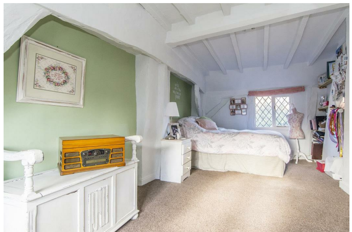
Bedroom Two 17'7" x 12'3" (5.36m x 3.73m)

A double bedroom with dual aspect windows, and exposed timber ceiling beams.