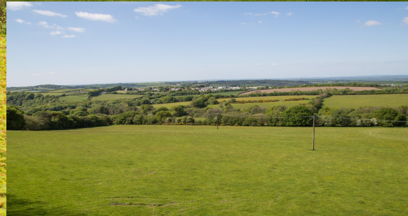
Westlake Farm Belstone, Devon EX20 1QY