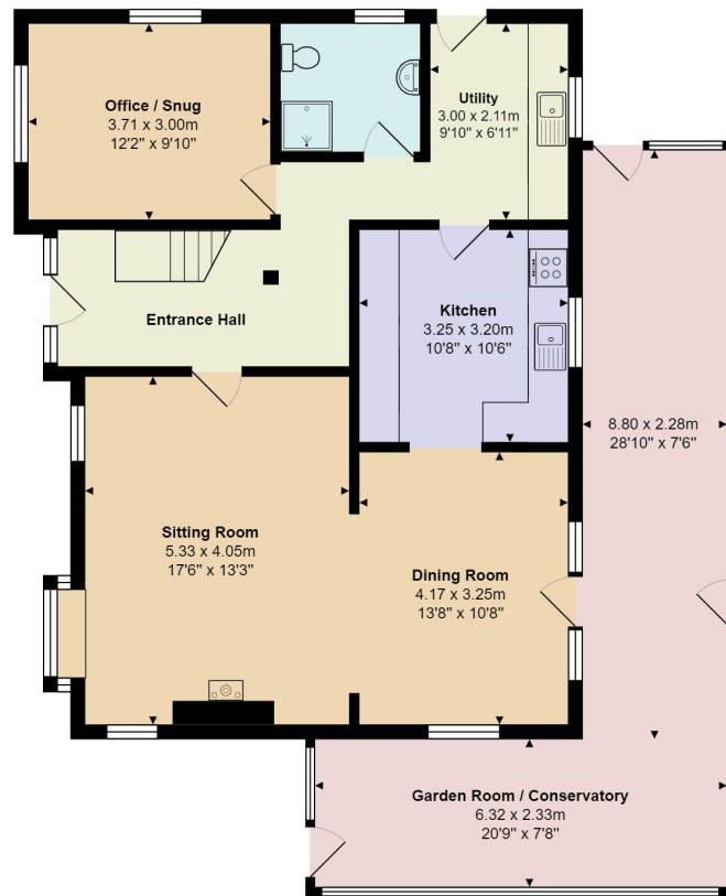
Ground Floor Area: 120.9 m 2 ... 1301 ft 2