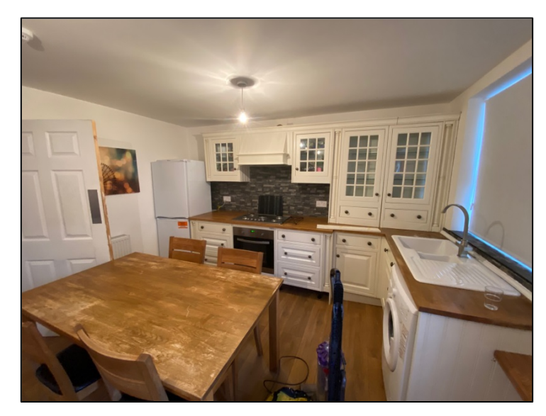
Price Offers based on £525,000