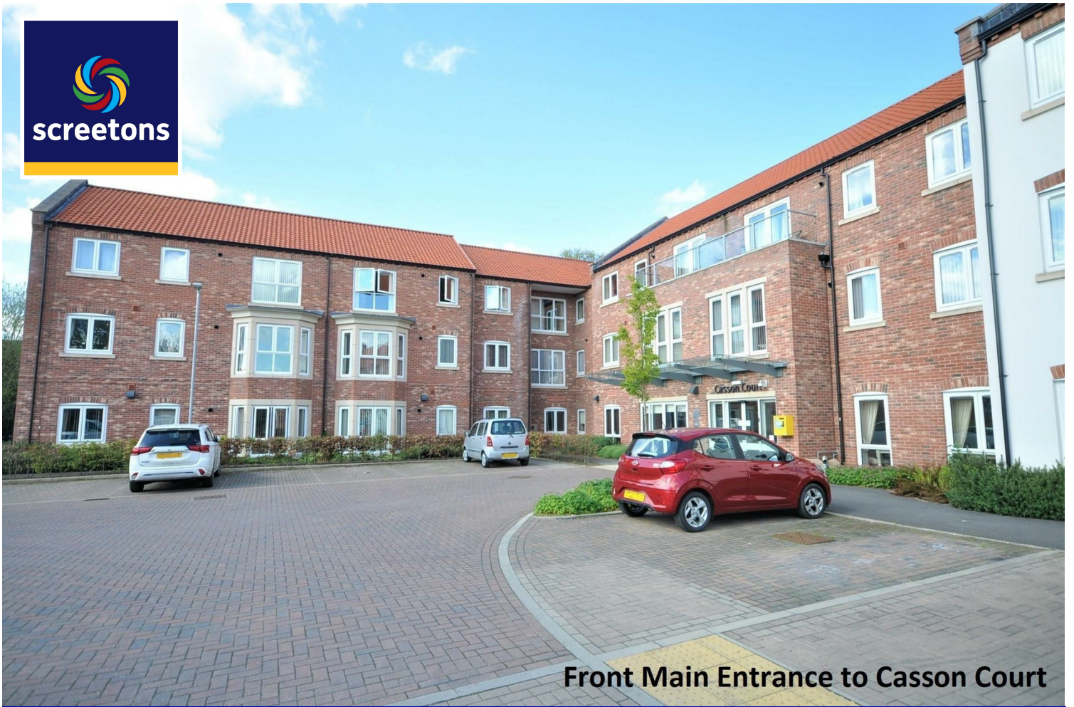
Front Main Entrance to Casson Court

70 Casson Court Church Street Thorne DN8 5BB