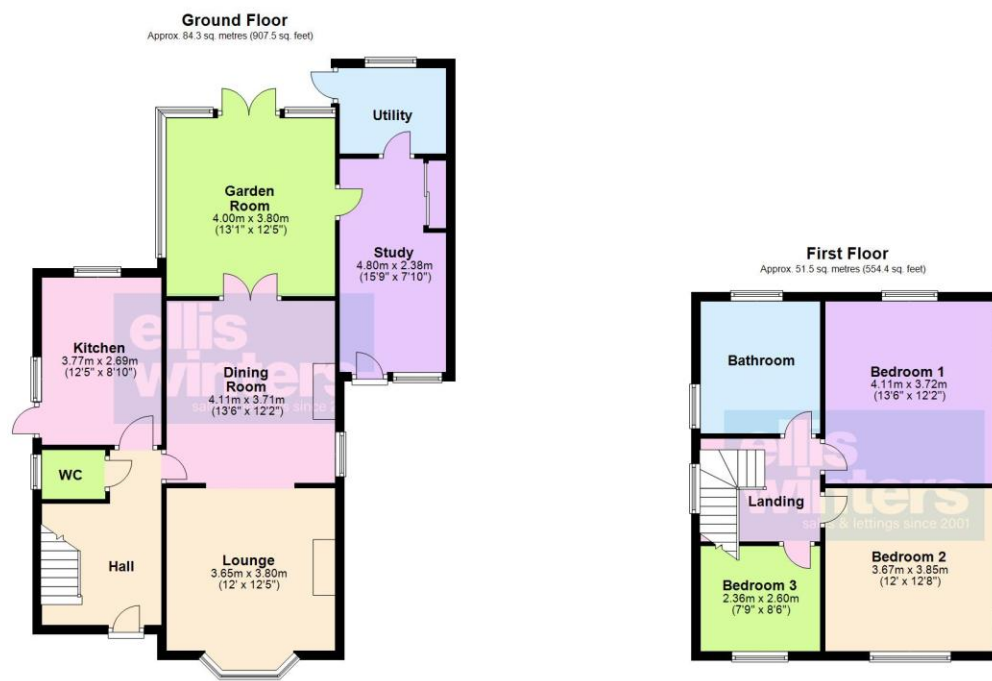
Total area: approx. 135.8 sq. metres (1461.9 sq. feet)

Ellis Winters has not tested any apparatus, equipment fitting or services and so cannot verify that they are in working order. The buyer is advised to obtain verification from their solicitor or surveyor. Floor plans are for representational purposes only and are not to scale.