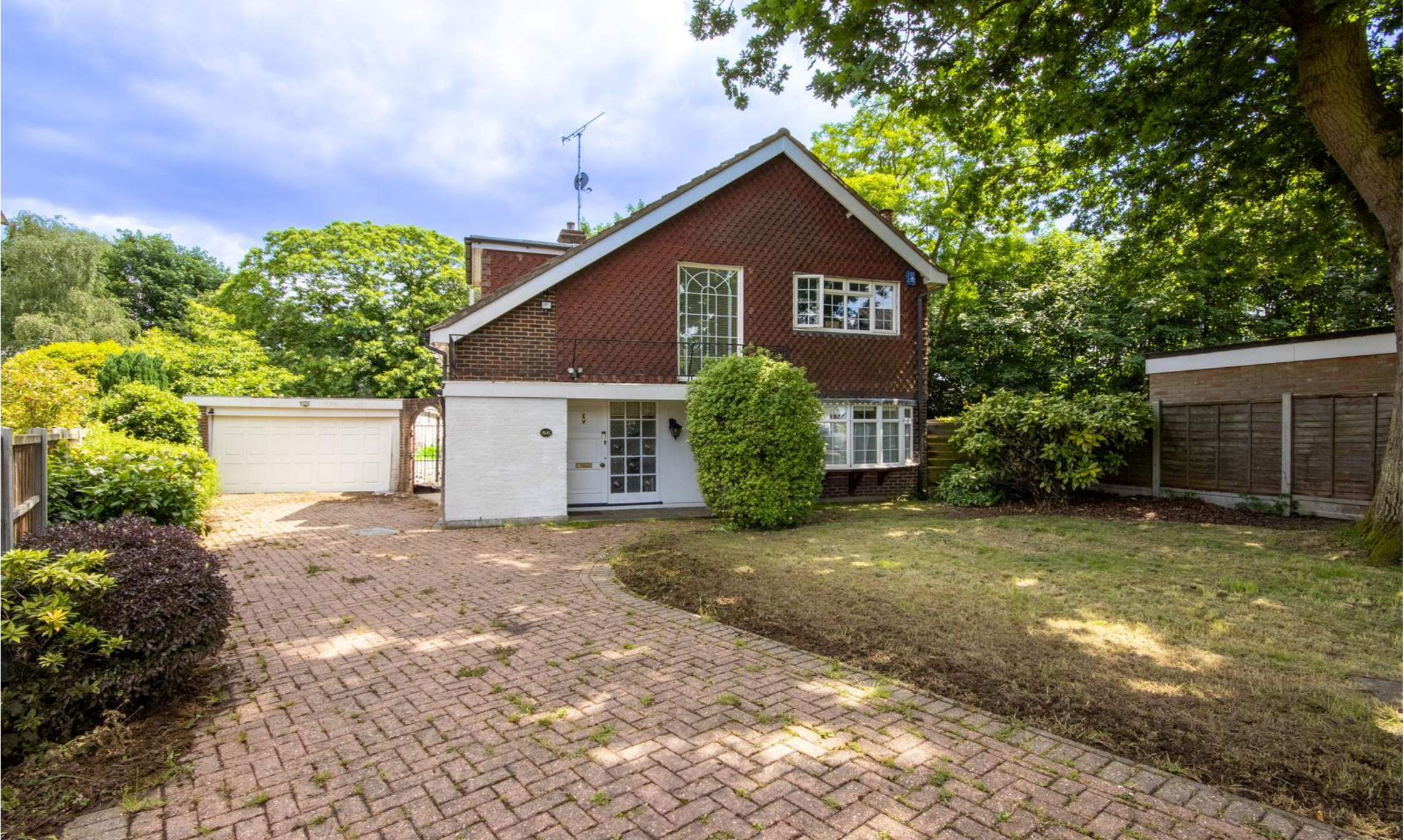
Shenfield Place, Shenfield