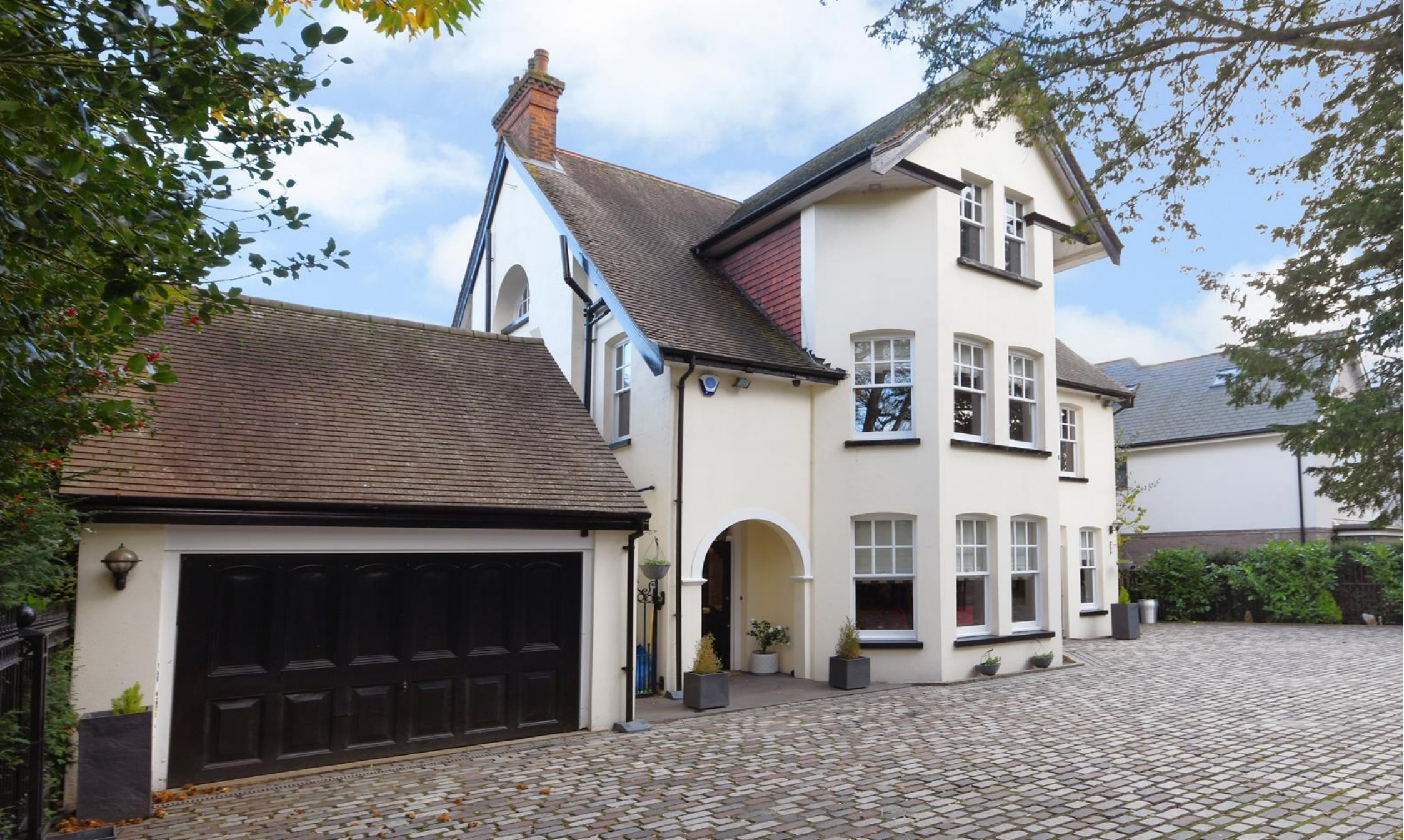
Hillwood Grove, Hutton Mount