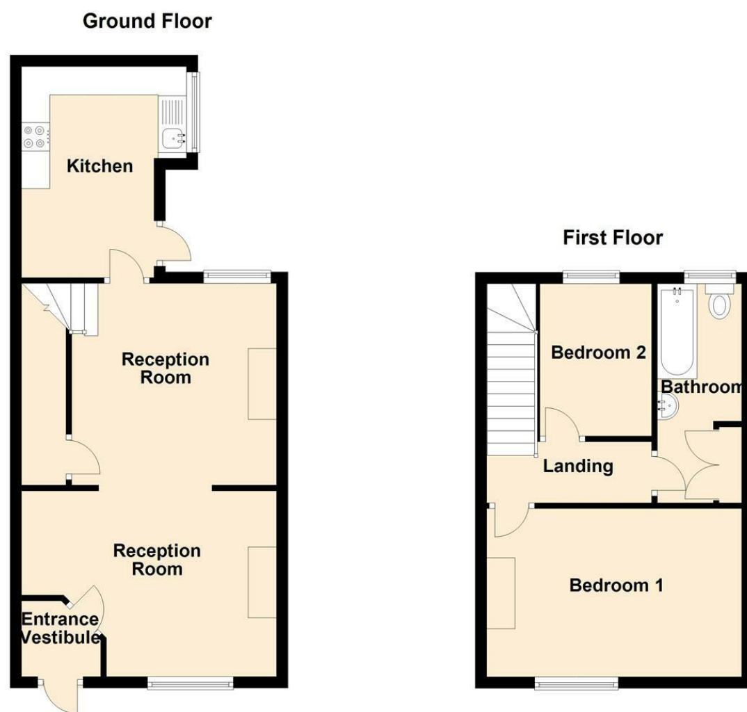
All floorplans are for guidance only. Not to scale. Please check all dimensions and shapes before making any decisions reliant upon them. Plan produced using PlanUp.