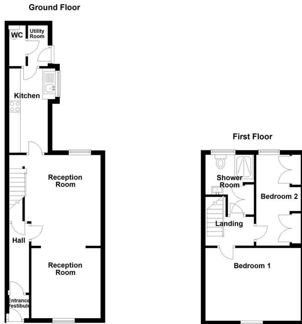
All floorplans are for guidance only. Not to scale. Please check all dimensions and shapes before making any decisions reliant upon them. Plan produced using PlanUp.