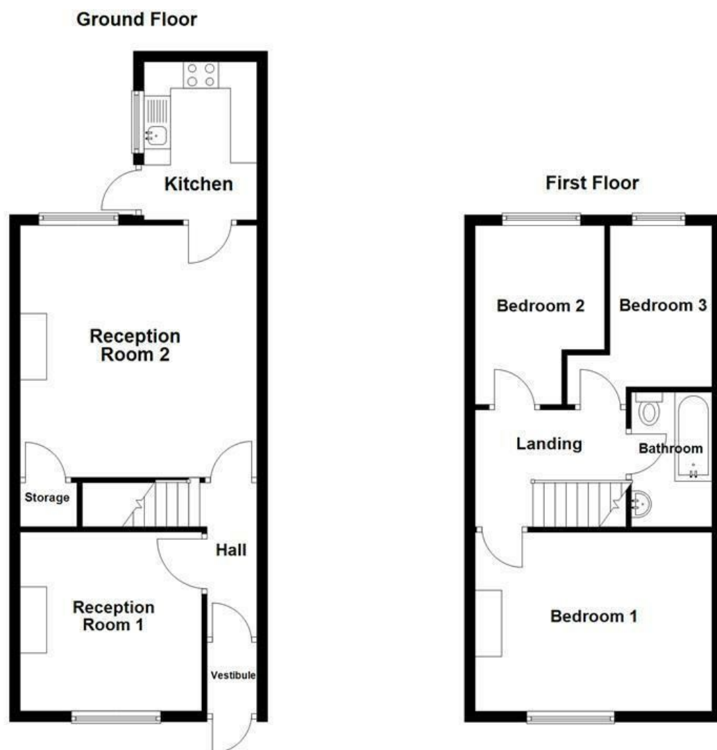
All floorplans are for guidance only. Not to scale. Please check all dimensions and shapes before making any decisions reliant upon them. Plan produced using PlanUp.