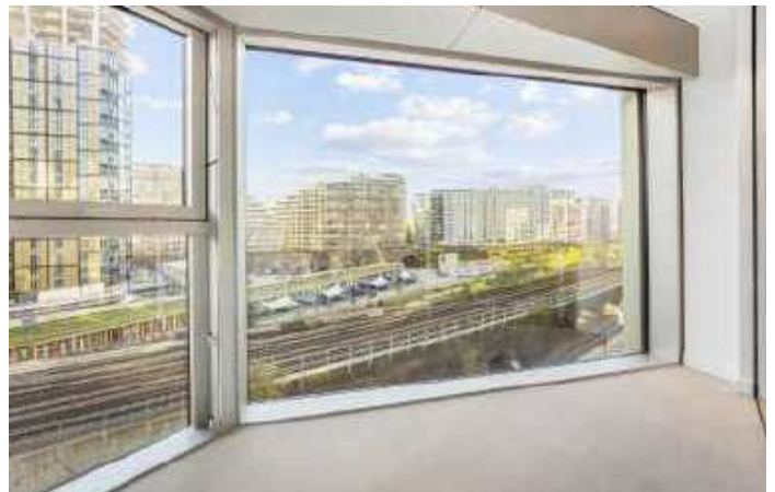
Electric Boulevard, SW11