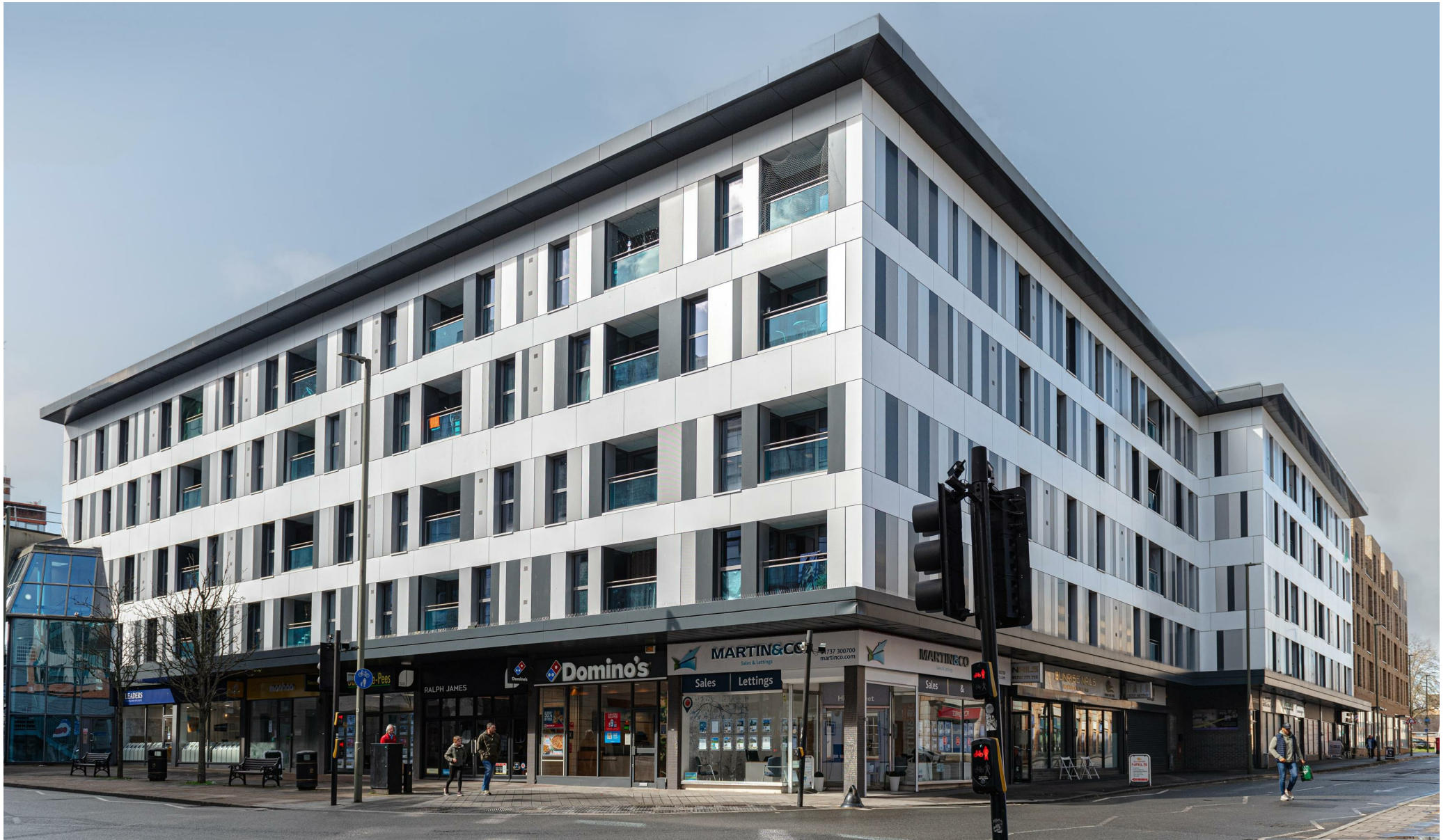
High Street, Redhill £225,000