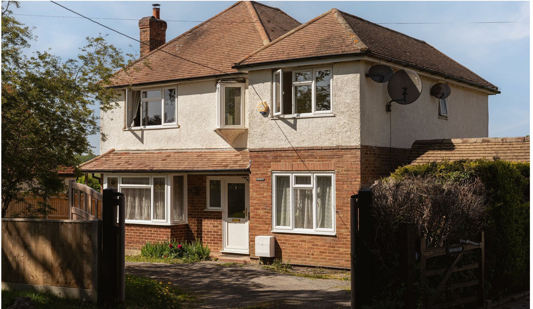
Lodge Lane, Redhill £850,000