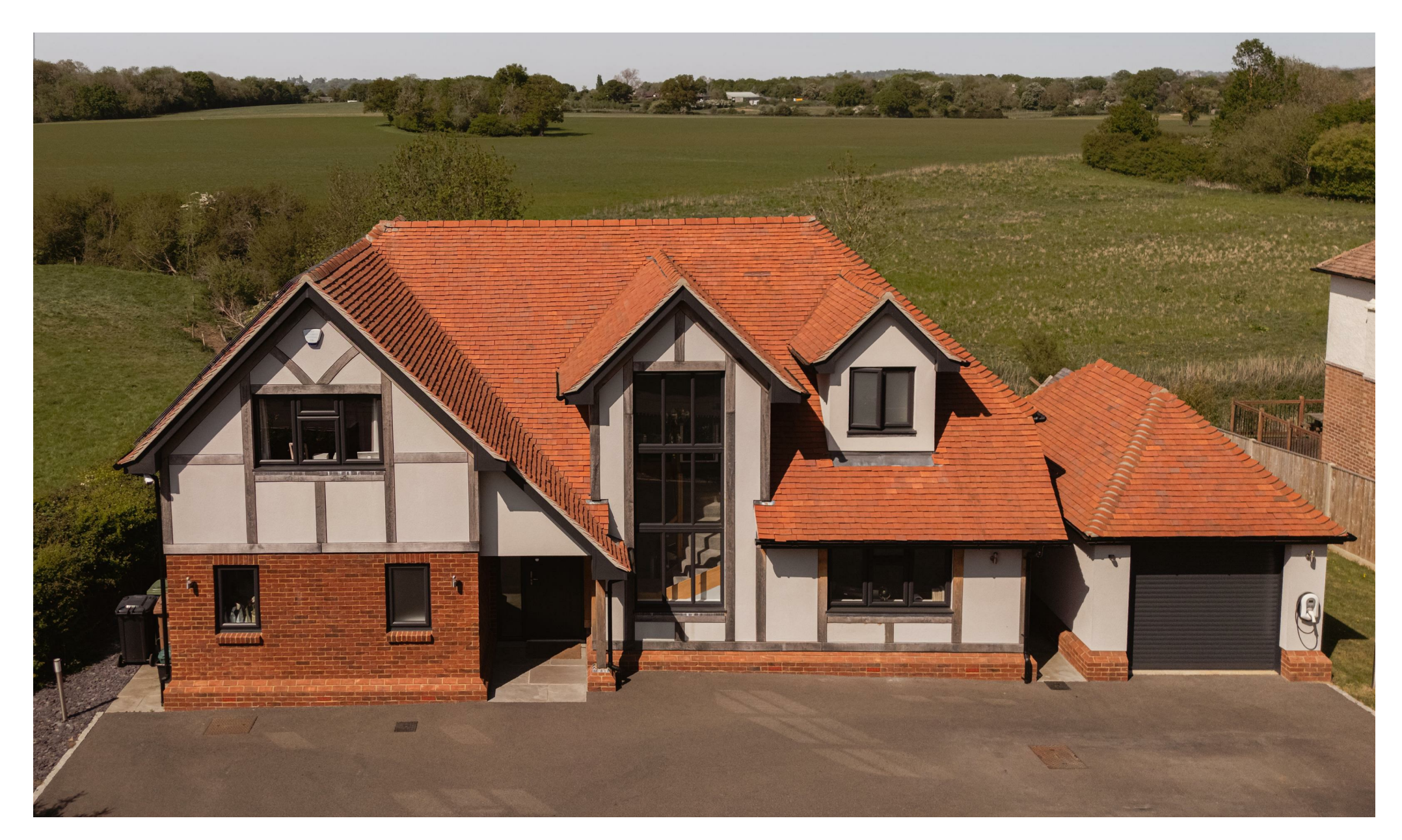
Lodge Lane, Redhill