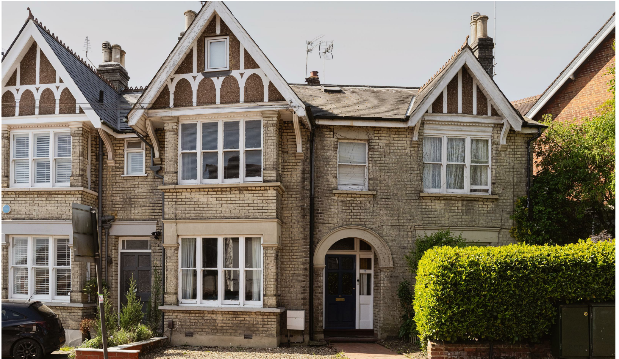
Fengates Road, Redhill £425,000