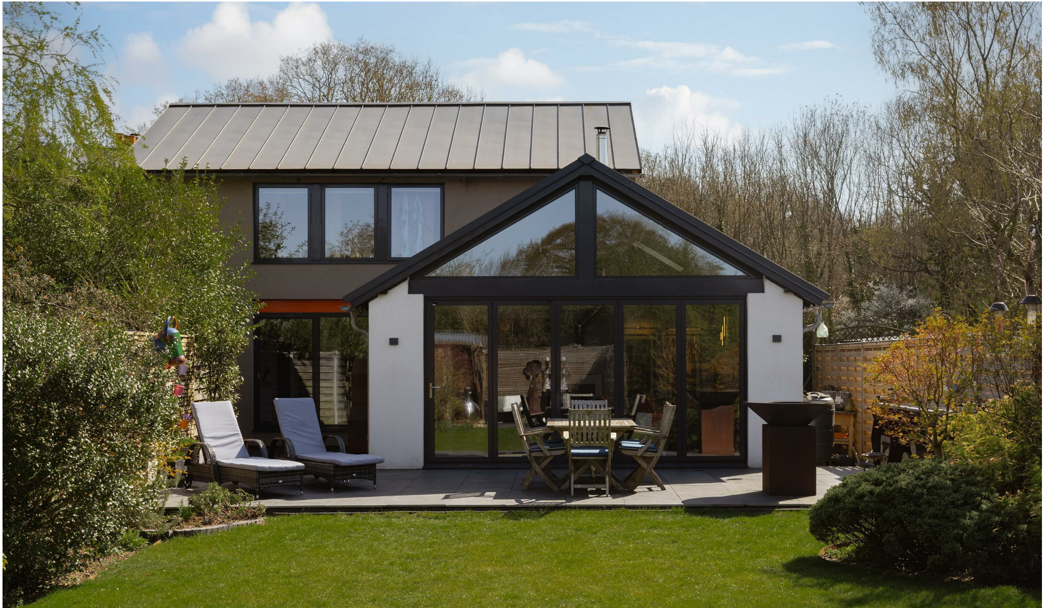
Hedgehog Gate, Masons Bridge Road