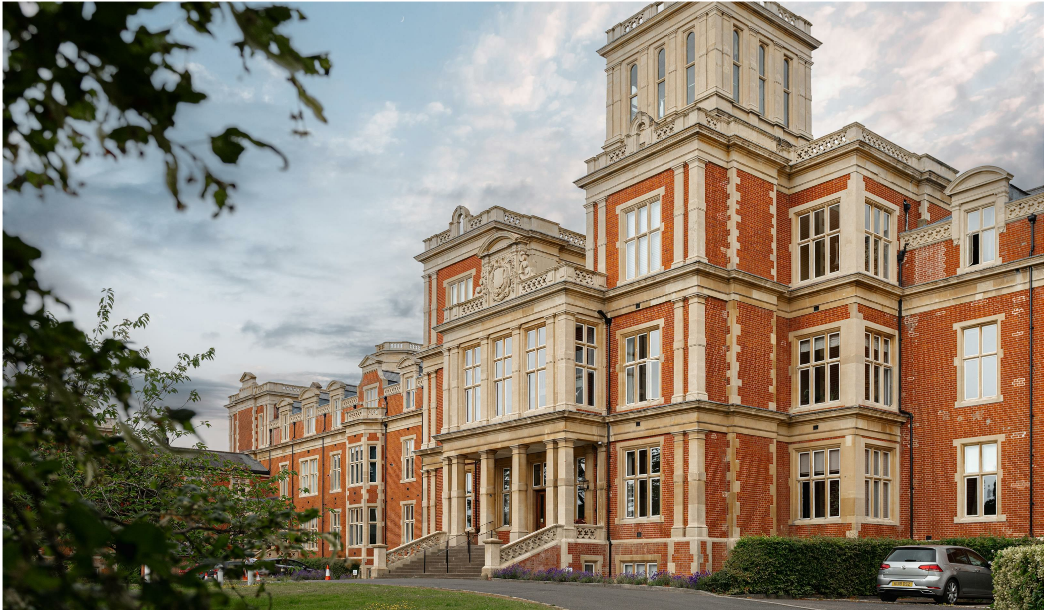
Royal Earlswood Park, Redhill £550,000