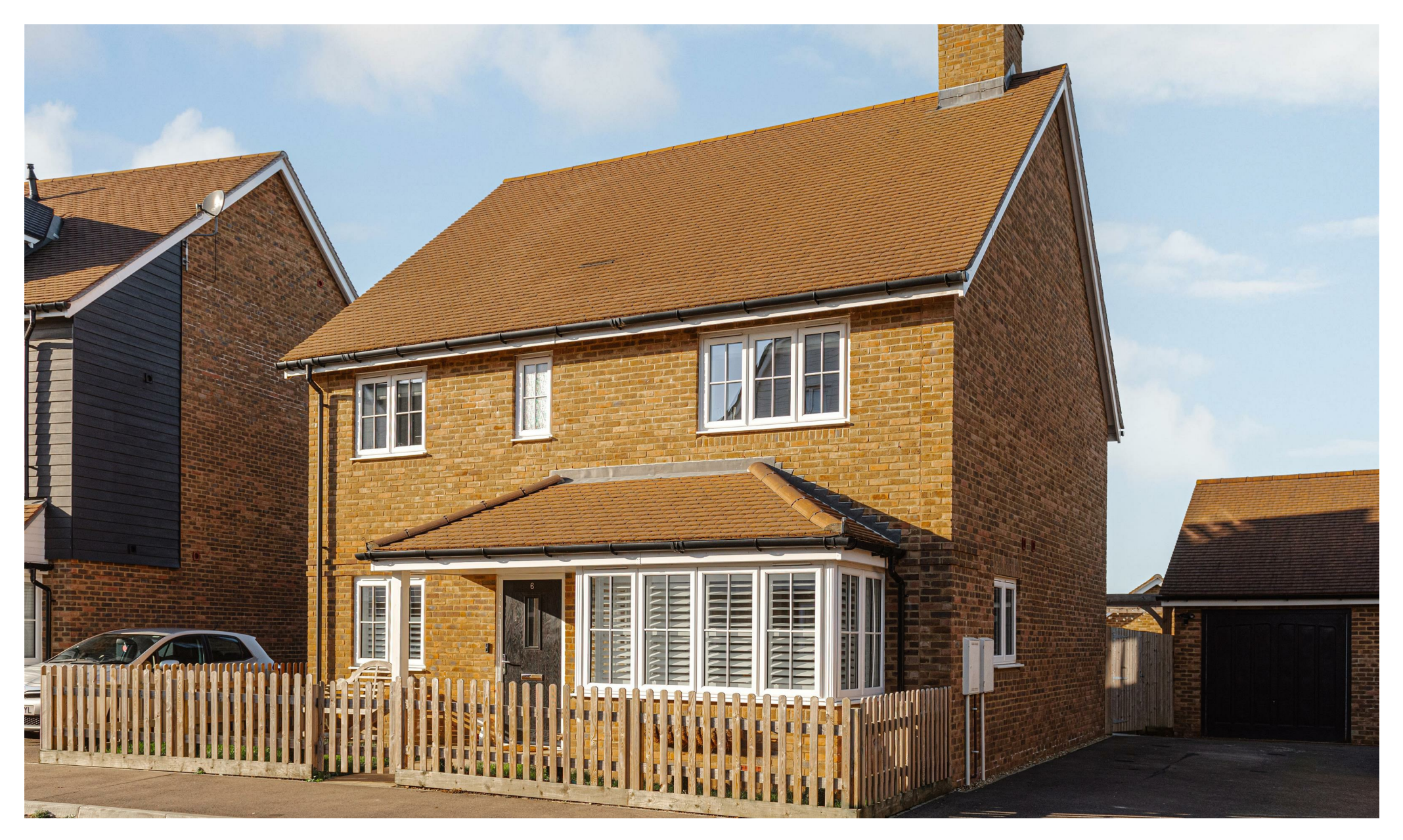
Reeves Crescent, Horley £725,000