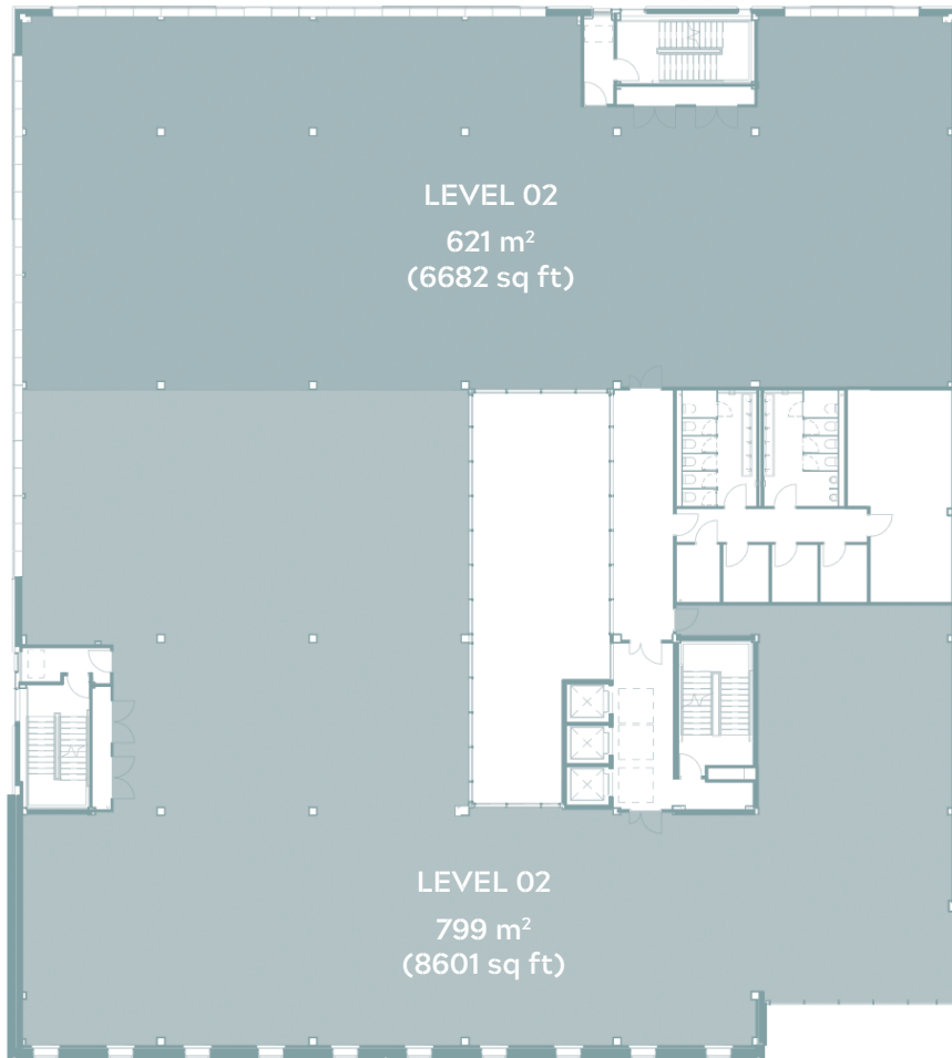
SECOND FLOOR PLAN (INDICATIVE LAYOUT)