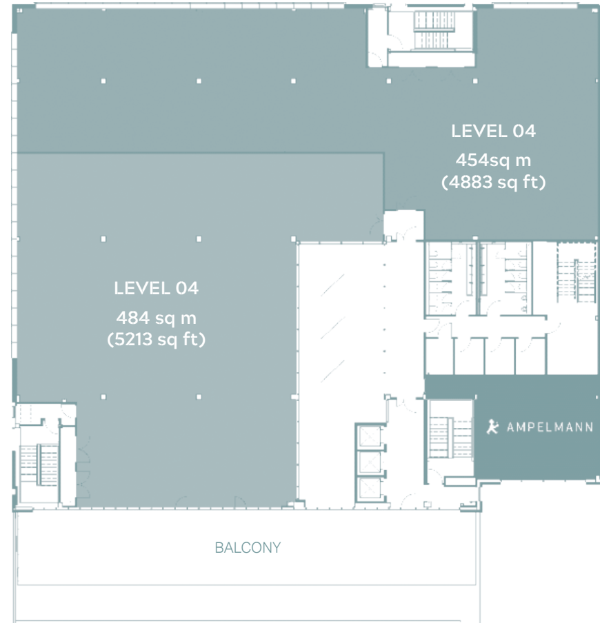
FOURTH FLOOR PLAN (INDICATIVE LAYOUT)