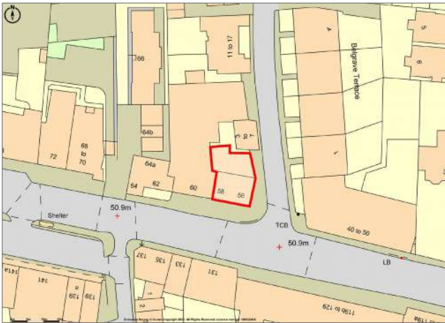
Promap Ordnance Survey Crown Copyright 2023. All rights reserved. Licence number 100022432. Plotted Scale - 1:750. Paper Size - A4