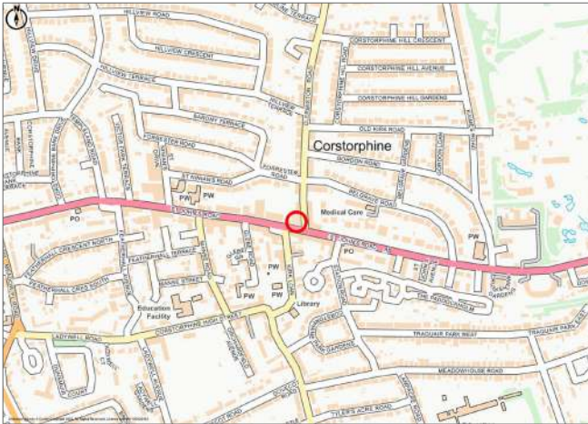
Licence number 100022432. Plotted Scale - 1:8000. Paper Size - A4