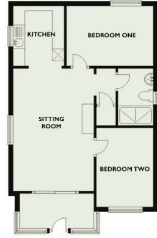
Garden Log Cabin