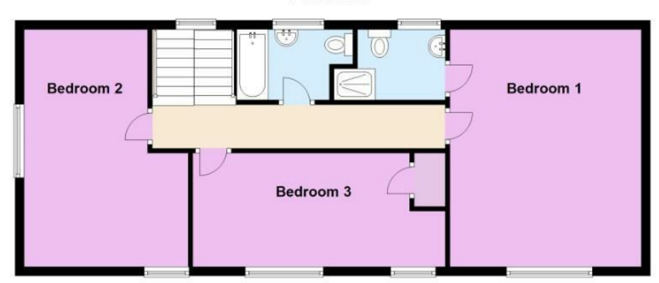
SKETCH PLAN FOR ILLUSTRATIVE PURPOSES ONLYAll measurments are approximate Plan produced using PlanUp.