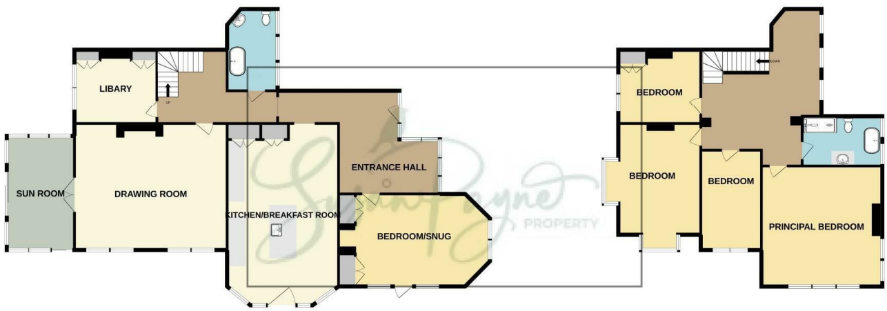
TOTAL FLOOR AREA : 2918 sq.ft. (271.1 sq.m.) approx.

Whilst every attempt has been made to ensure the accuracy of the floorplan contained here, measurements of doors, windows, rooms and any other items are approximate and no responsibility is taken for any error, omission or mis-statement. This plan is for illustrative purposes only and should be used as such by any prospective purchaser. The services, systems and appliances shown have not been tested and no guarantee as to their operability or efficiency can be given. Made with Metropix ©2022