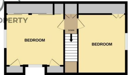
TOTAL FLOOR AREA : 1757 sq.ft. (163.2 sq.m.) approx.

Whilst every attempt has been made to ensure the accuracy of the floorplan contained here, measurements of doors, windows, rooms and any other items are approximate and no responsibility is taken for any error, omission or mis-statement. This plan is for illustrative purposes only and should be used as such by any prospective purchaser. The services, systems and appliances shown have not been tested and no guarantee as to their operability or efficiency can be given. Made with Metropix ©2024