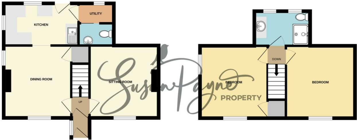
TOTAL FLOOR AREA: 782 sq.ft. (72.6 sq.m.) approx.

Whilst every attempt has been made to ensure the accuracy of the floorplan contained here, measurements of doors, windows, rooms and any other items are approximate and no responsibility is taken for any error, omission or mis-statement. This plan is for illustrative purposes only and should be used as such by any prospective purchaser. The services, systems and appliances shown have not been tested and no guarantee as to their operability or efficiency can be given. Made with Metropix ©2024