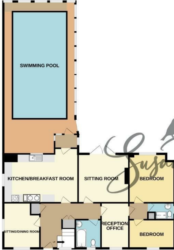
GROUND FLOOR 1834 sq.ft. (170.4 sq.m.) approx.