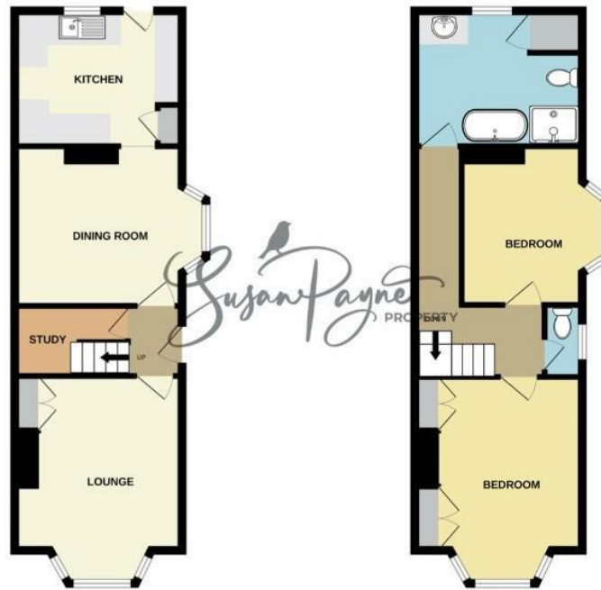
TOTAL FLOOR AREA: 841 sq ft (78.2 sq m) approx. Whilst every attempt has been made to ensure the accuracy of the floorplan contained here, measurements of doors, windows, stairs and all other levels and approximations and no responsibility is taken for any error, omission or mis-statement. This plan is for illustrative purposes only and should be used as such for any immediate purchase. The furniture, fixtures and appliances shown have not been tested and no guarantee as to their operability or efficiency can be given. Made with Mapbox CO2x