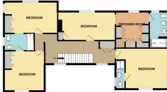
1ST FLOOR 1057 sq.ft. (98.2 sq.m.) approx.