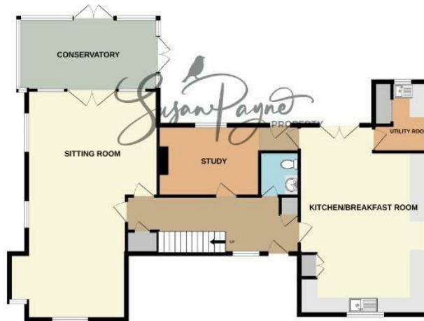
GROUND FLOOR 1286 sq.ft. (119.5 sq.m.) approx.

TOTAL FLOOR AREA : 2343 sq.ft. (217.7 sq.m.) approx.