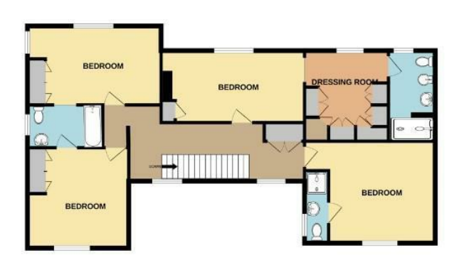
1ST FLOOR 1057 sq.ft. (98.2 sq.m.) approx.