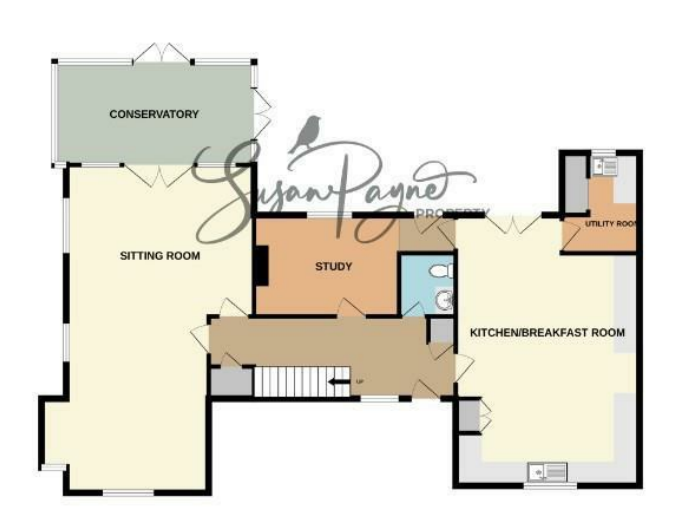
GROUND FLOOR 1286 sq.ft. (119.5 sq.m.) approx.