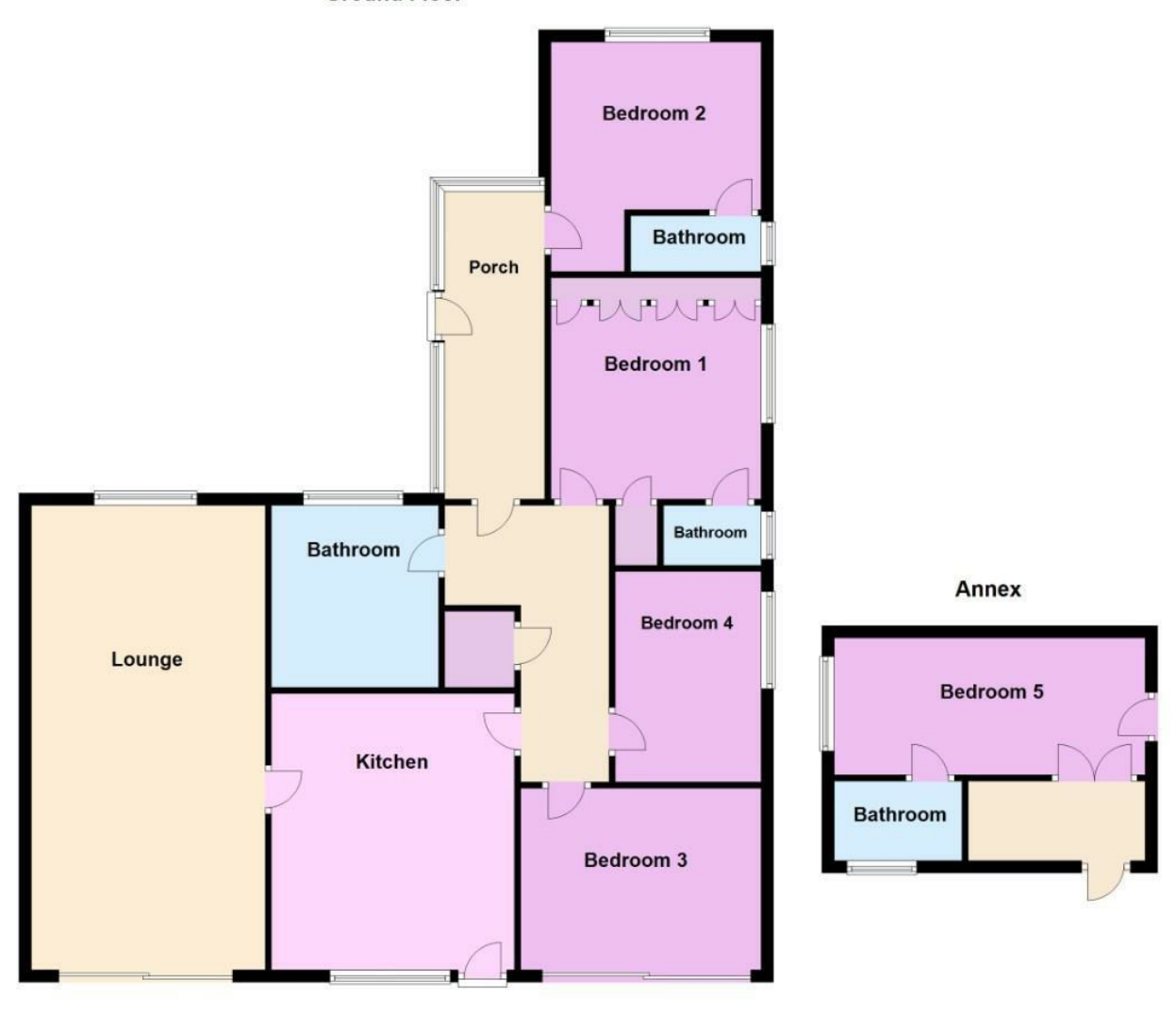
SKETCH PLAN FOR ILLUSTRATIVE PURPOSES ONLYAll measurments are approximate. Plan produced using PlanUp.