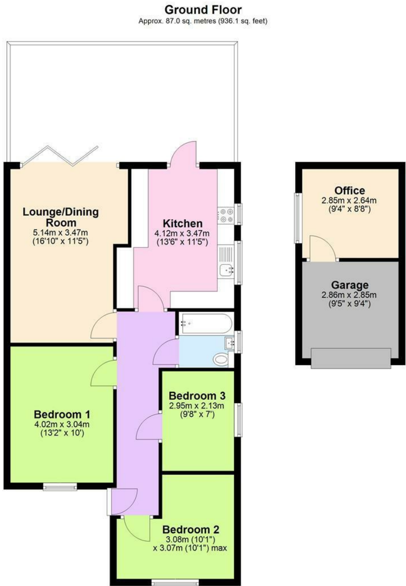
Total area: approx. 87.0 sq. metres (936.1 sq. feet)