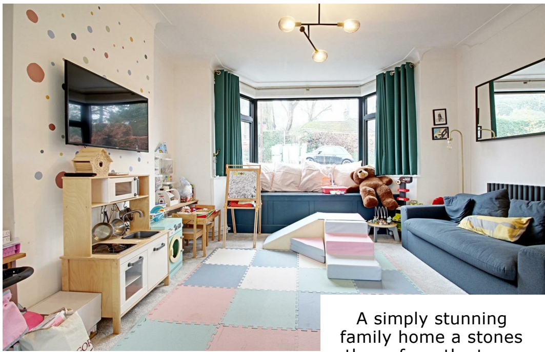
A simply stunning family home a stones throw from the town centre and amenities.