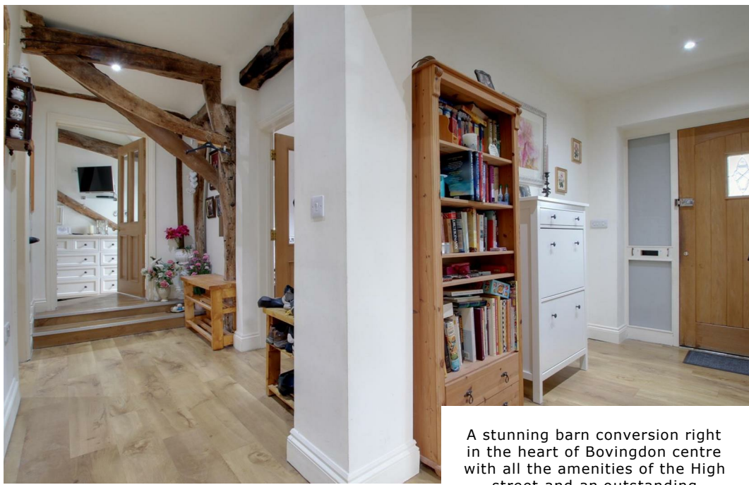
A stunning barn conversion right in the heart of Bovington centre with all the amenities of the High street and an outstanding primary school. Offering character features and exposed timber beams, this property is a must see.