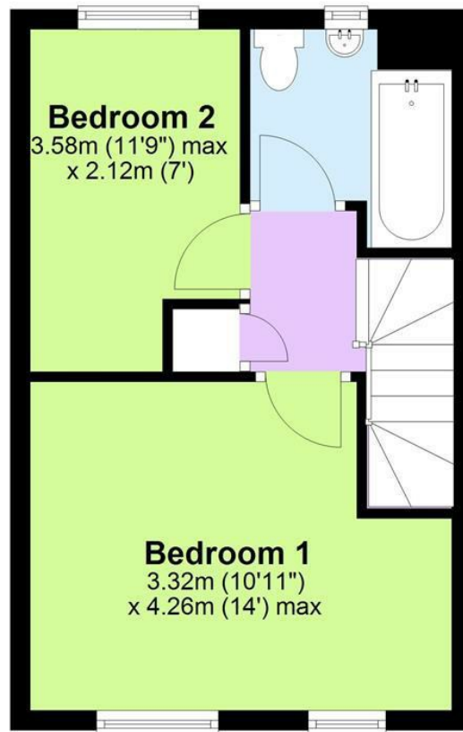
First Floor Approx. 29.5 sq. metres (317.8 sq. feet)

Total area: approx. 58.9 sq. metres (634.0 sq. feet)